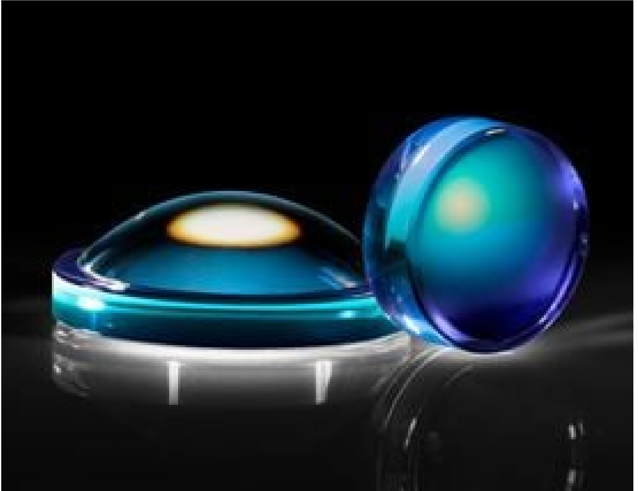
Precision Molded Aspheric Lenses