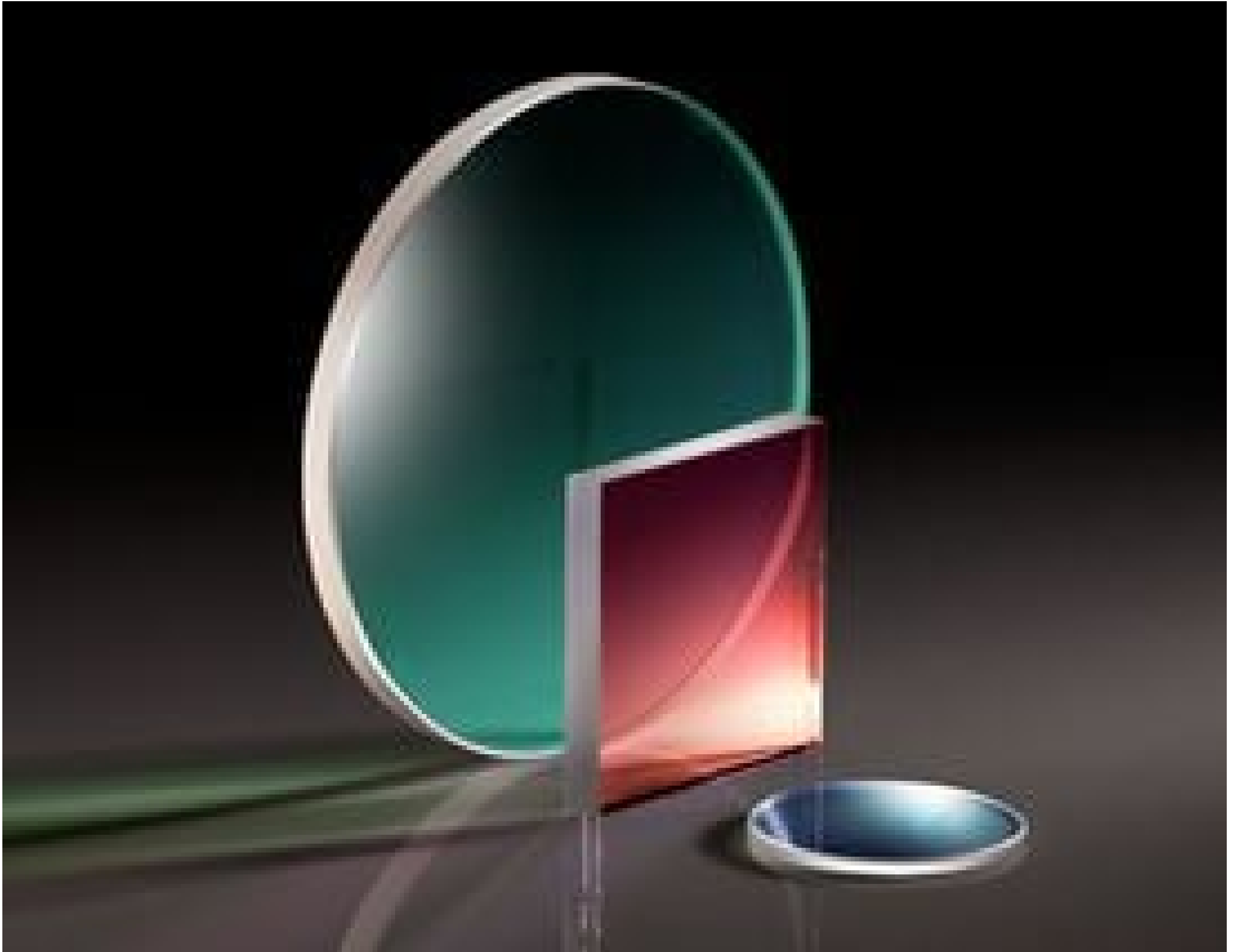
TECHSPEC High Performance Hot Mirrors