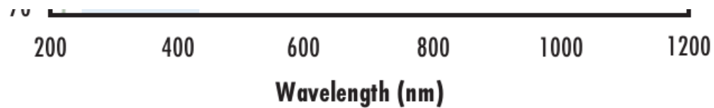
Fused Silica with UV-VIS Coating Typical Transmission