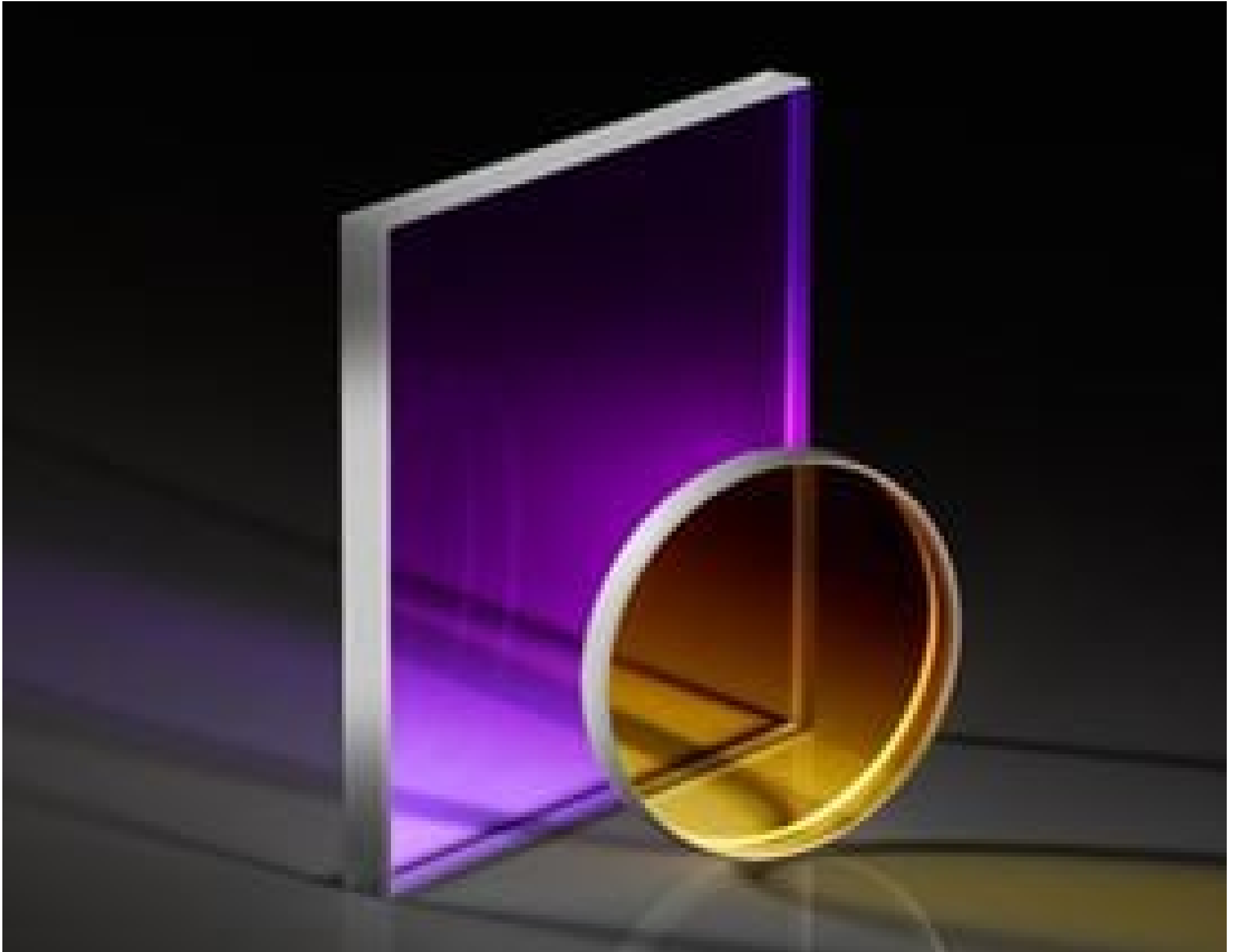
TECHSPEC® 1λ UV Fused Silica Windows