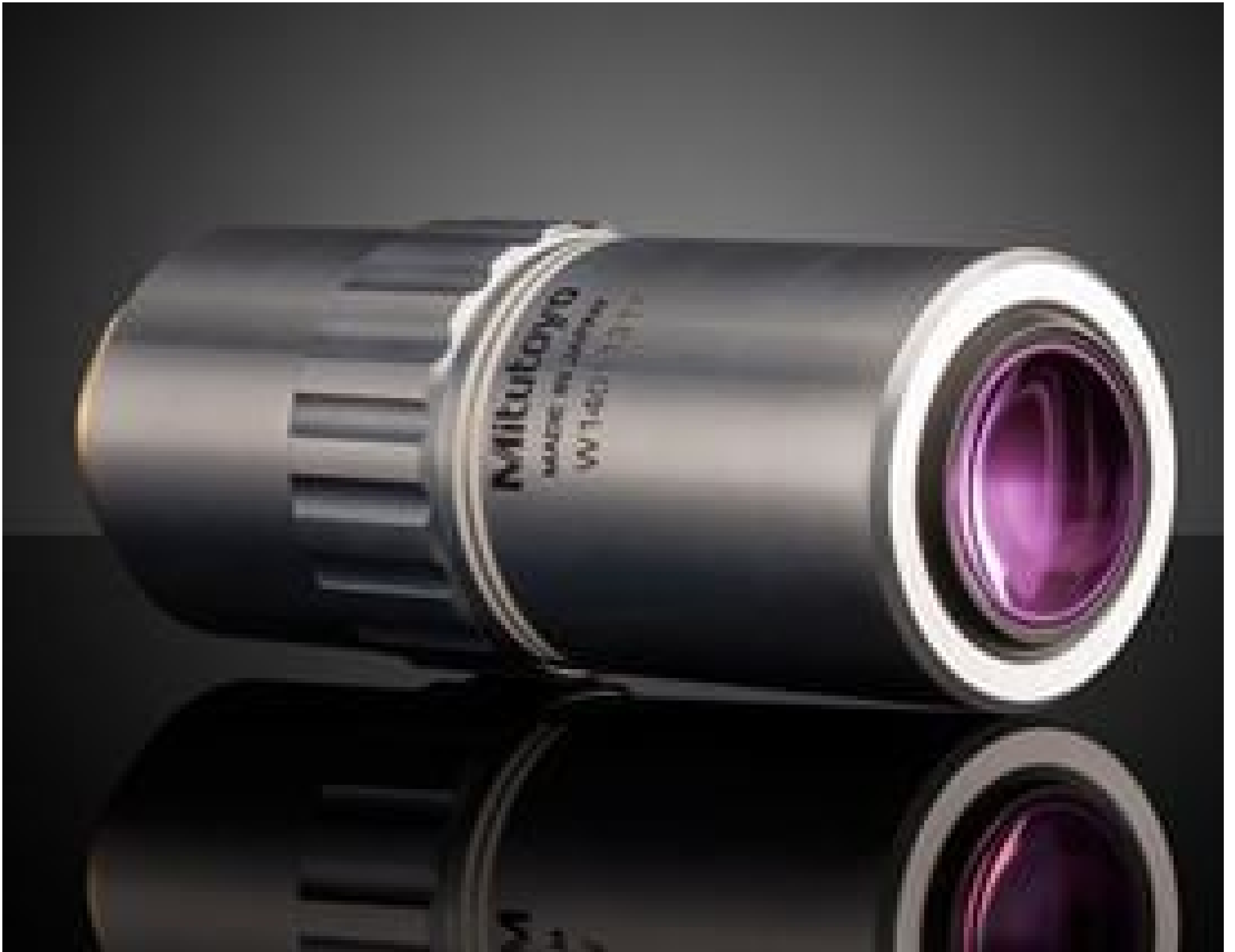
100X Mitutoyo Plan Apo SL Infinity Corrected Objective, #46-401