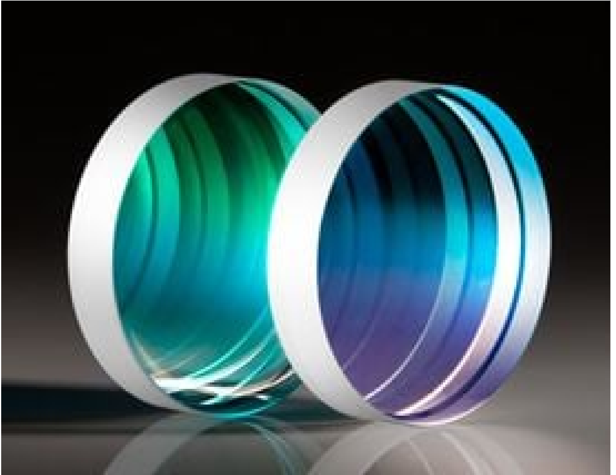
Laser Line Non-Polarizing Plate Beamsplitters