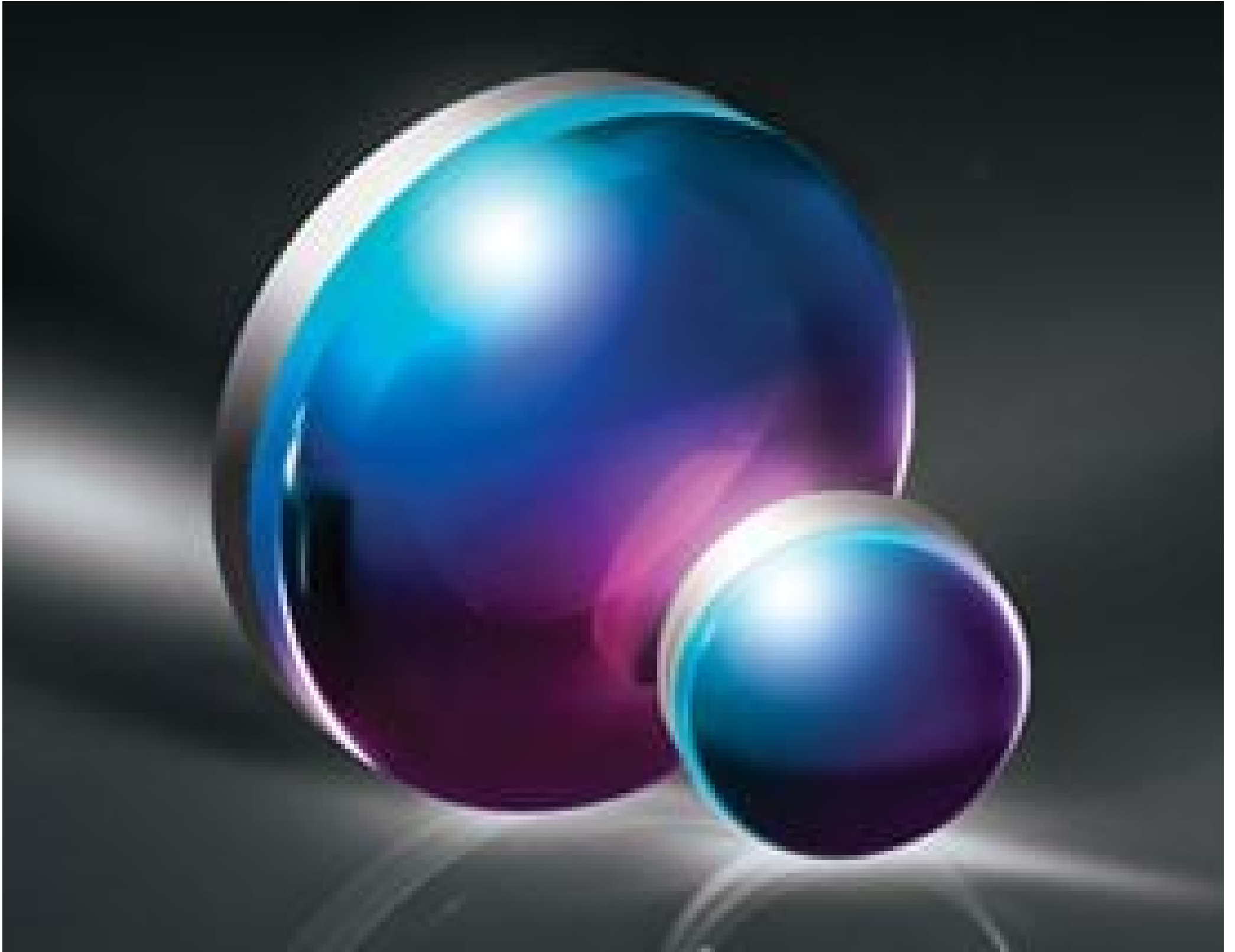
YAG-BBAR Coated Double-Convex (DCX) Lenses