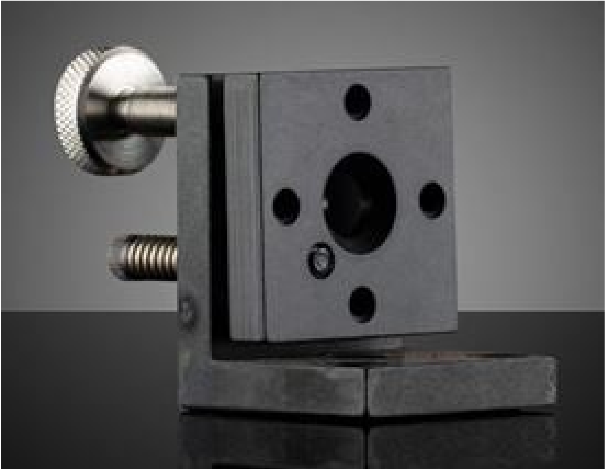
1.0" Angle Mirror Mount