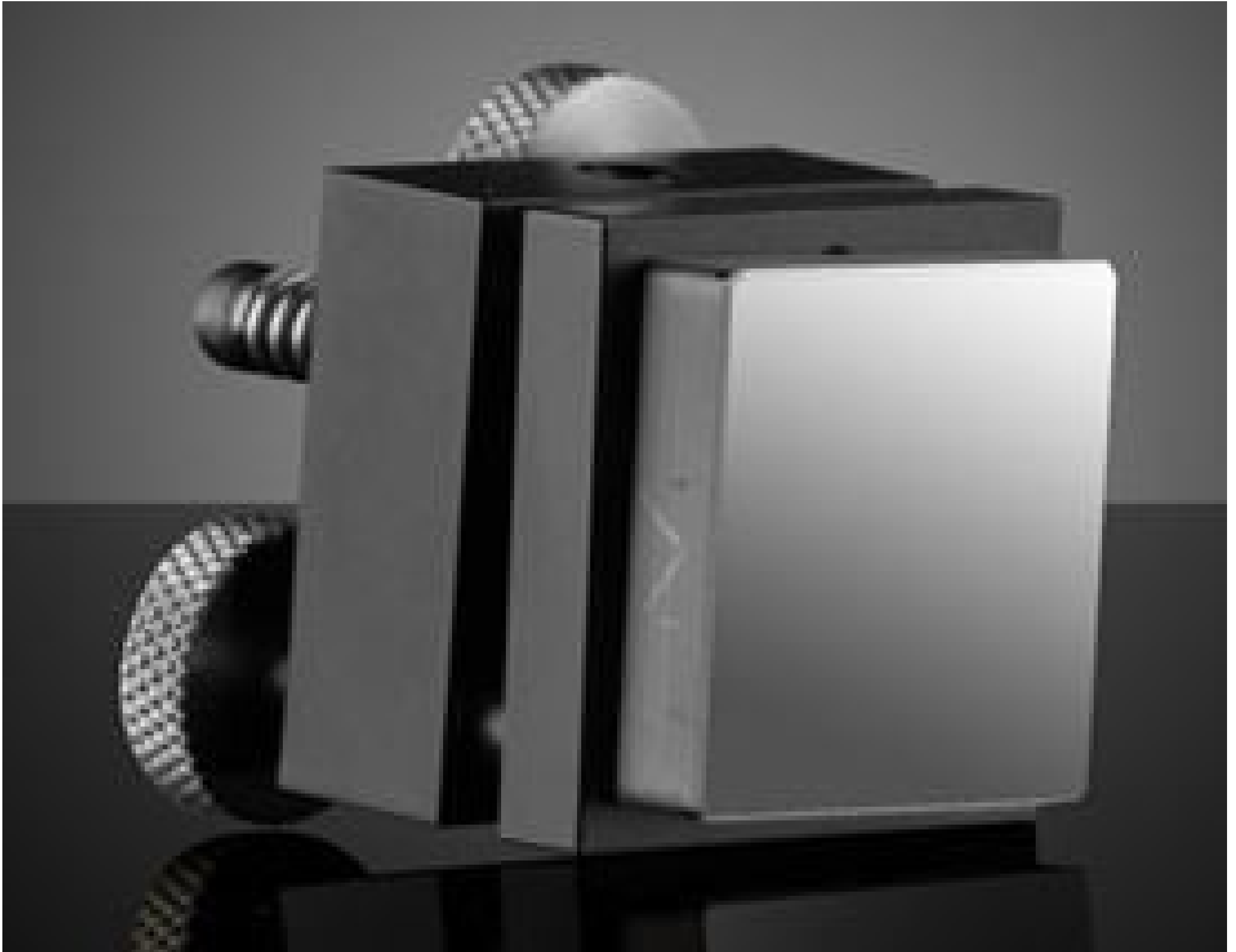
Mirror Mount with Mirror