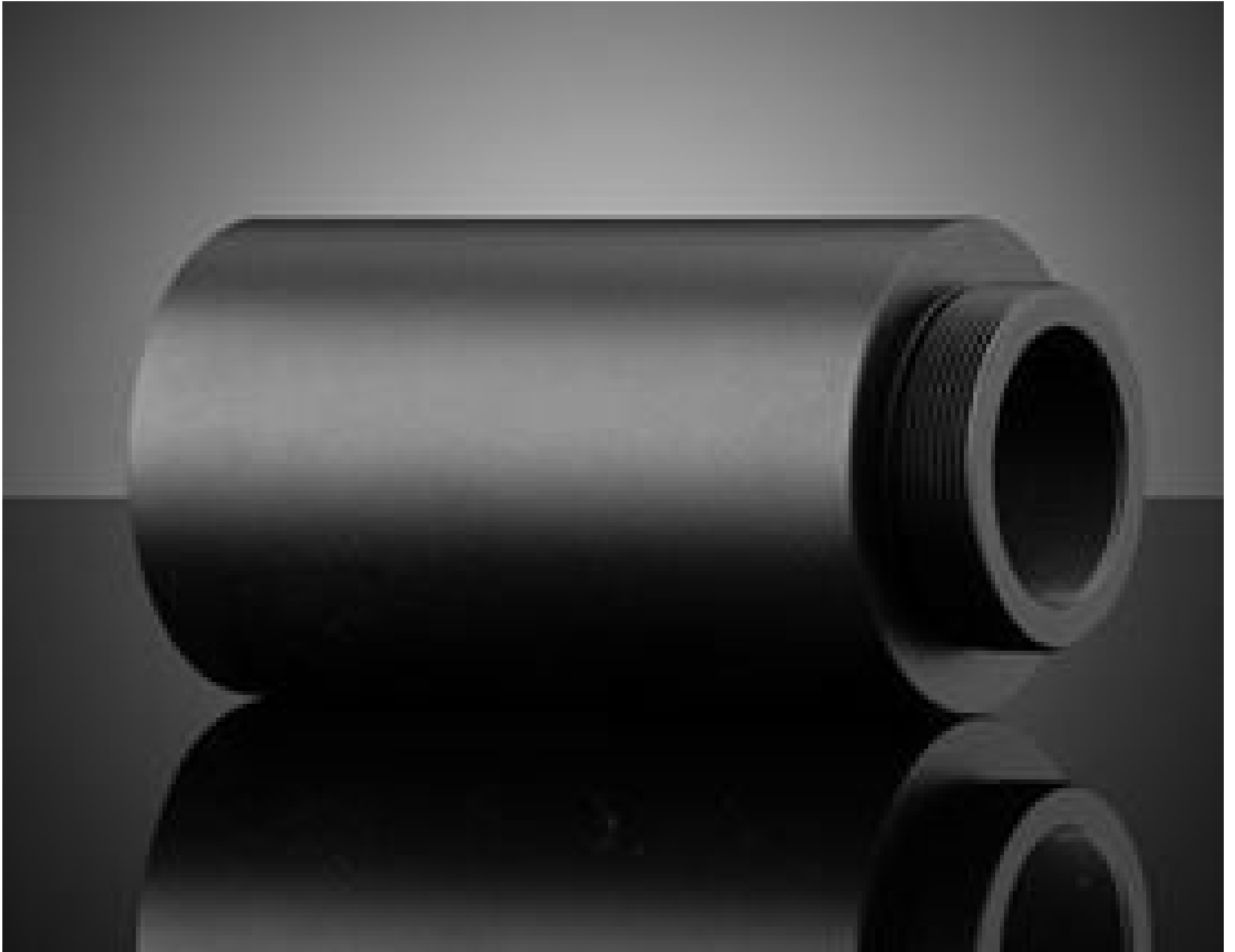
#24-218: 5X, 95mm M26 Parfocal Adapter