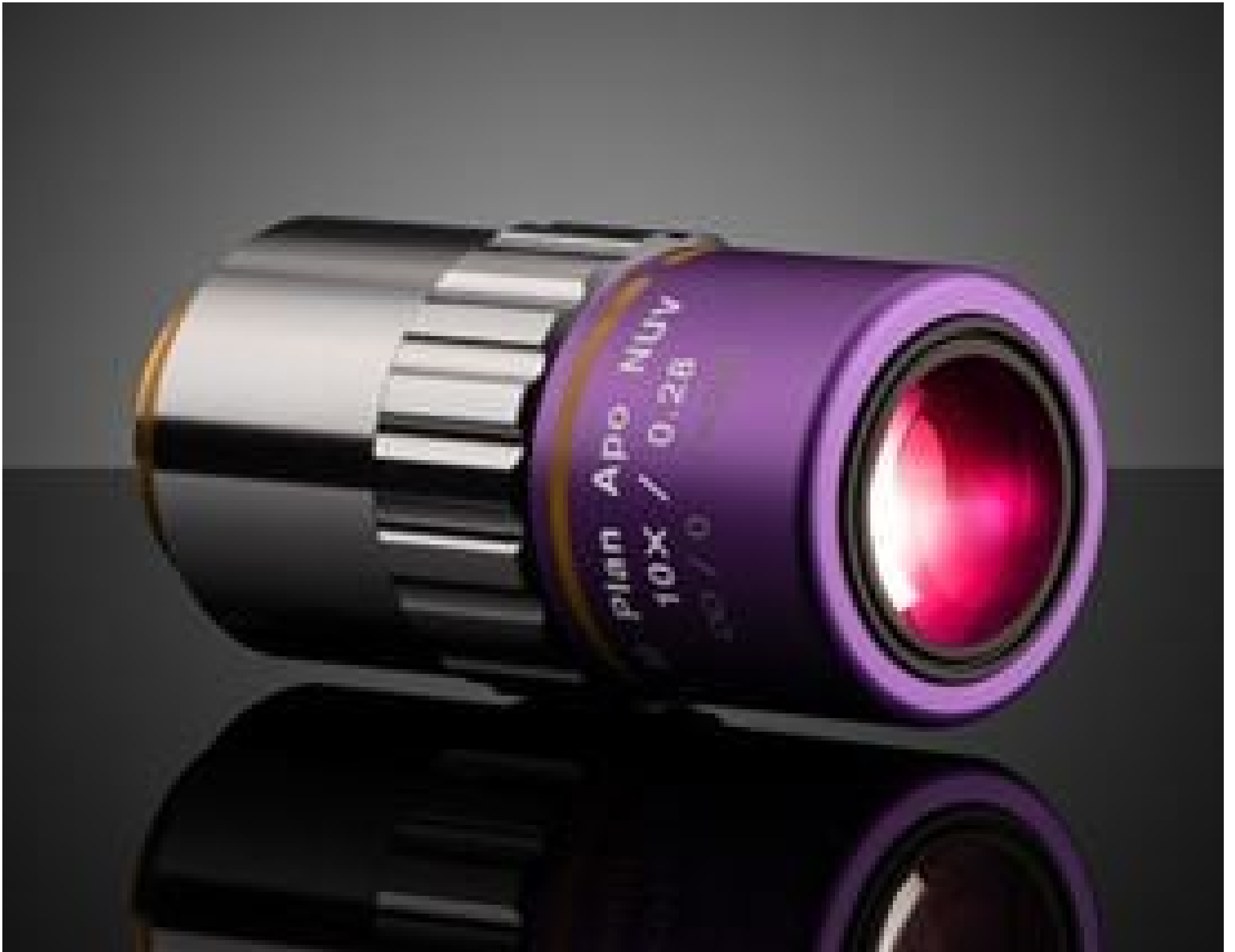
10X Mitutoyo Plan Apo NUV Infinity Corrected Objective, #86-176