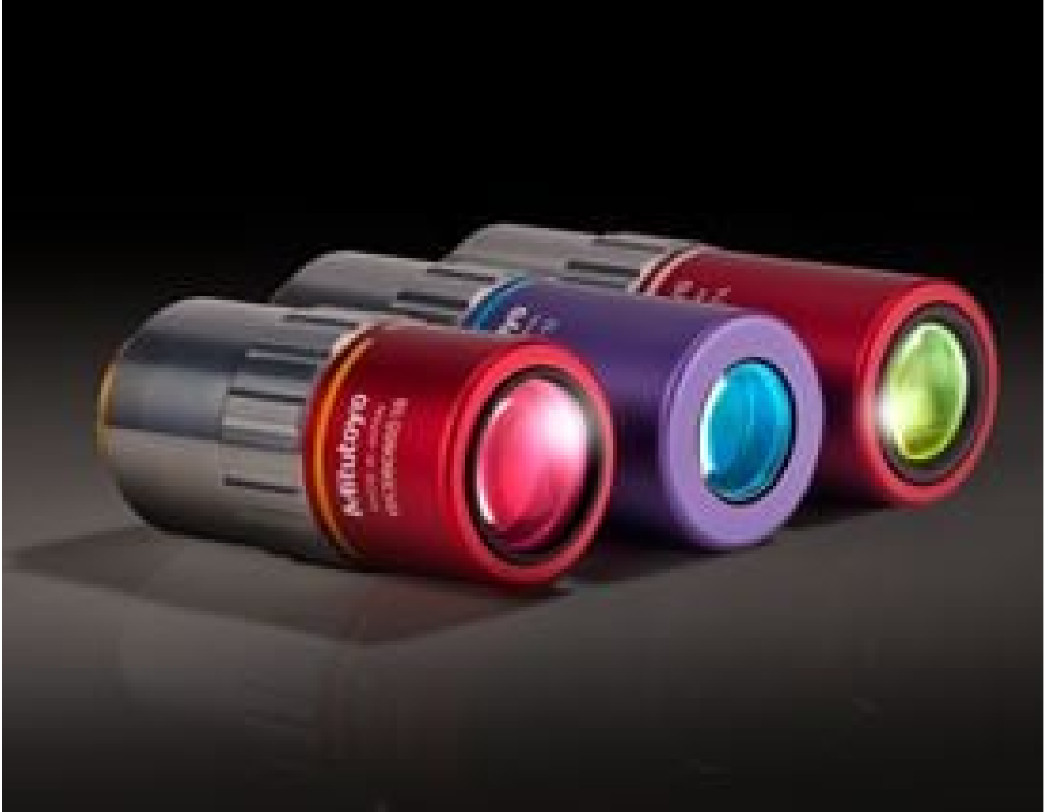
Mitutoyo NIR, NUV, and UV Infinity Corrected Objectives