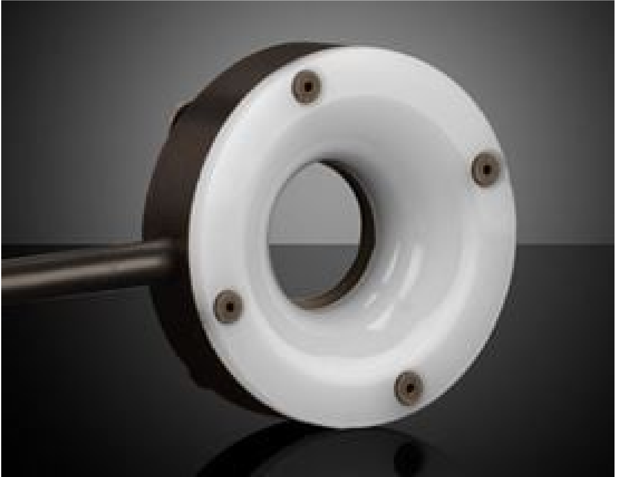
Advanced Illumination MicroBrite Diffuse Darkfield Ring Lights