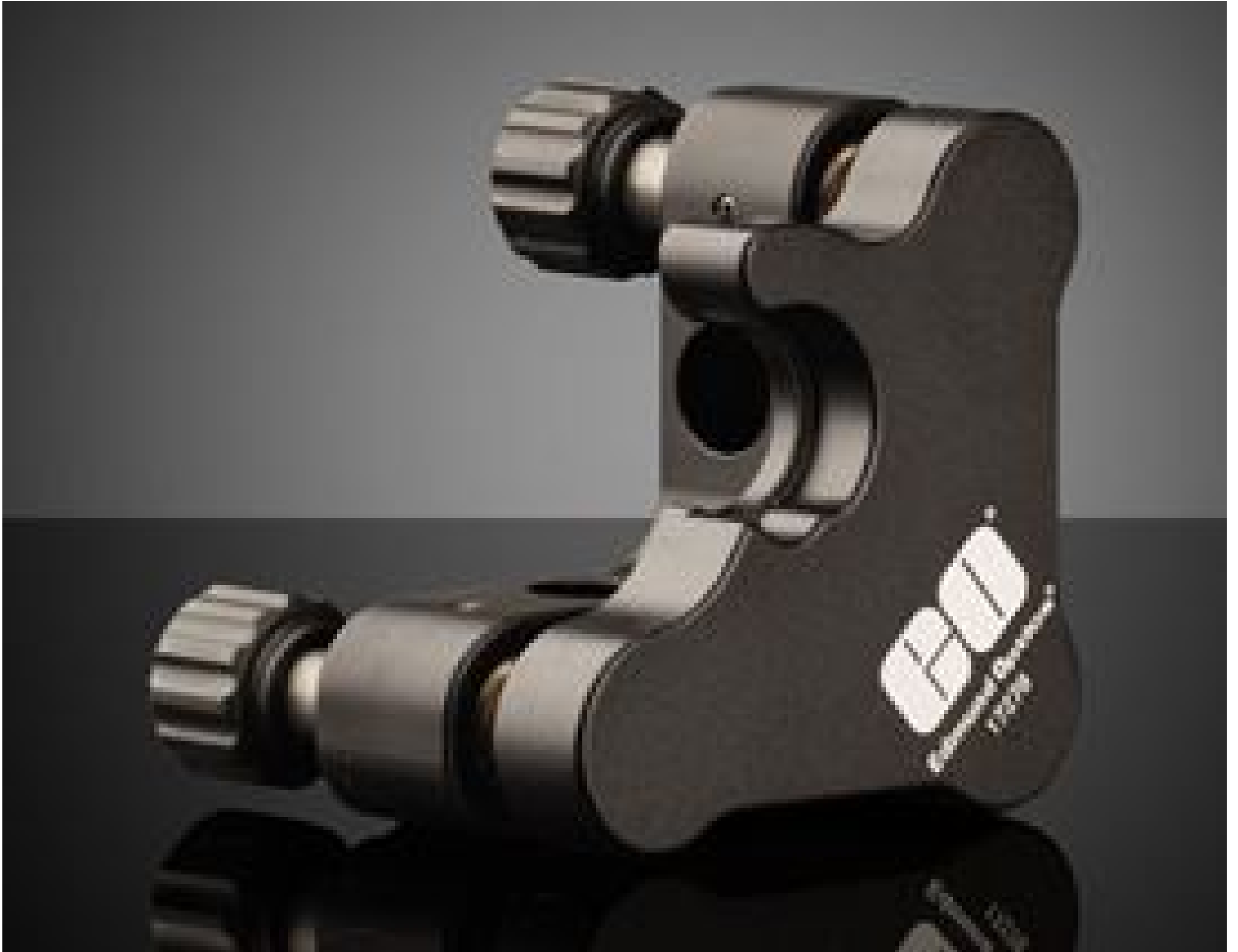
#17-278, 12.5/12.7mm Optic Dia., E-Series Clear Edge Kinematic Mount