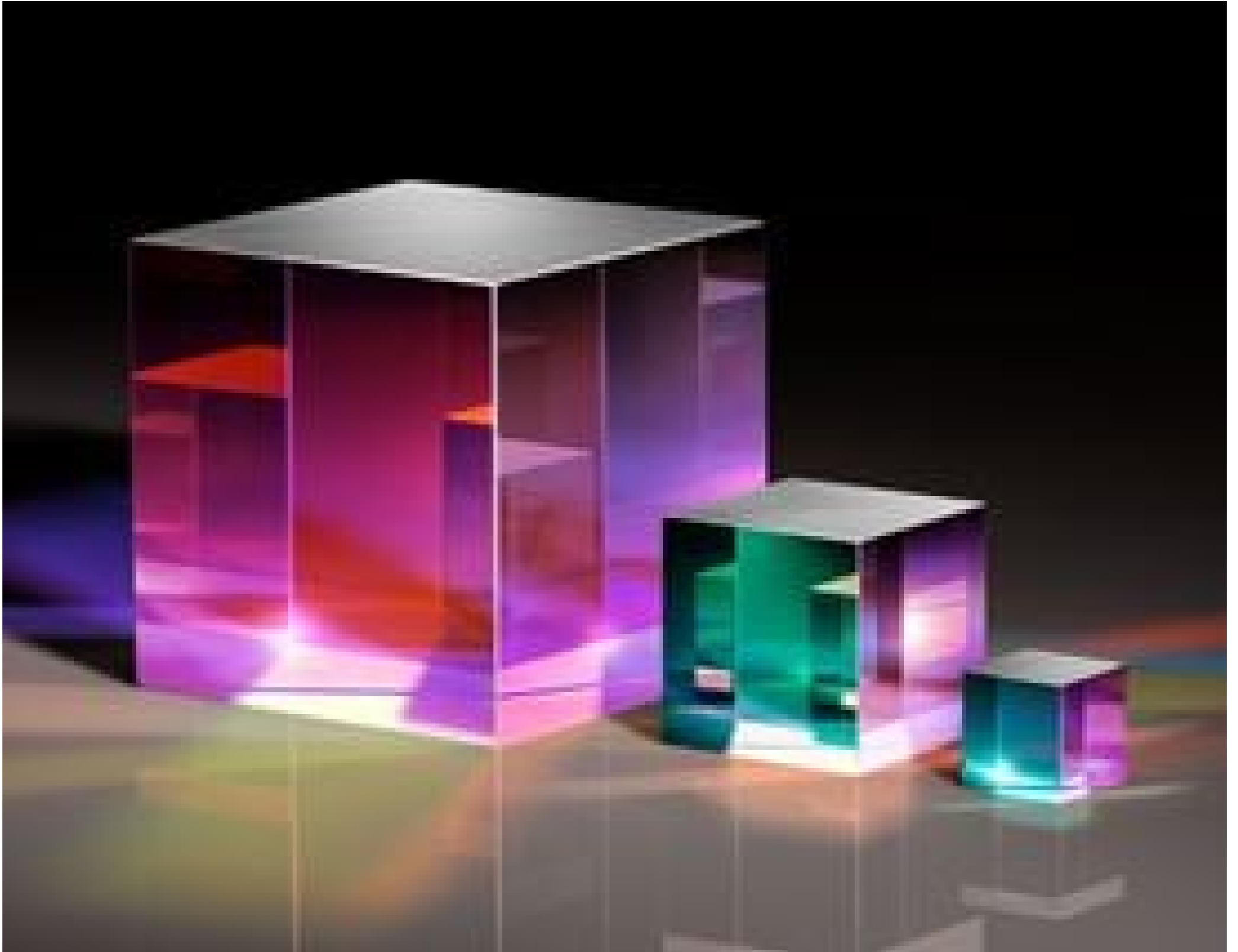
TECHSPEC Laser Line Polarizing Cube Beamsplitters