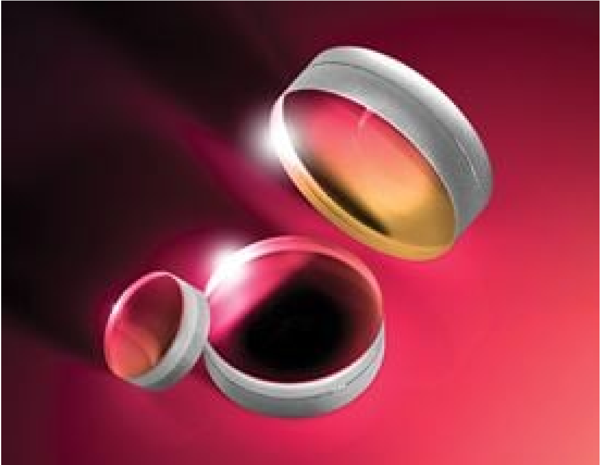
YAG-BBAR Coated Achromatic Lenses