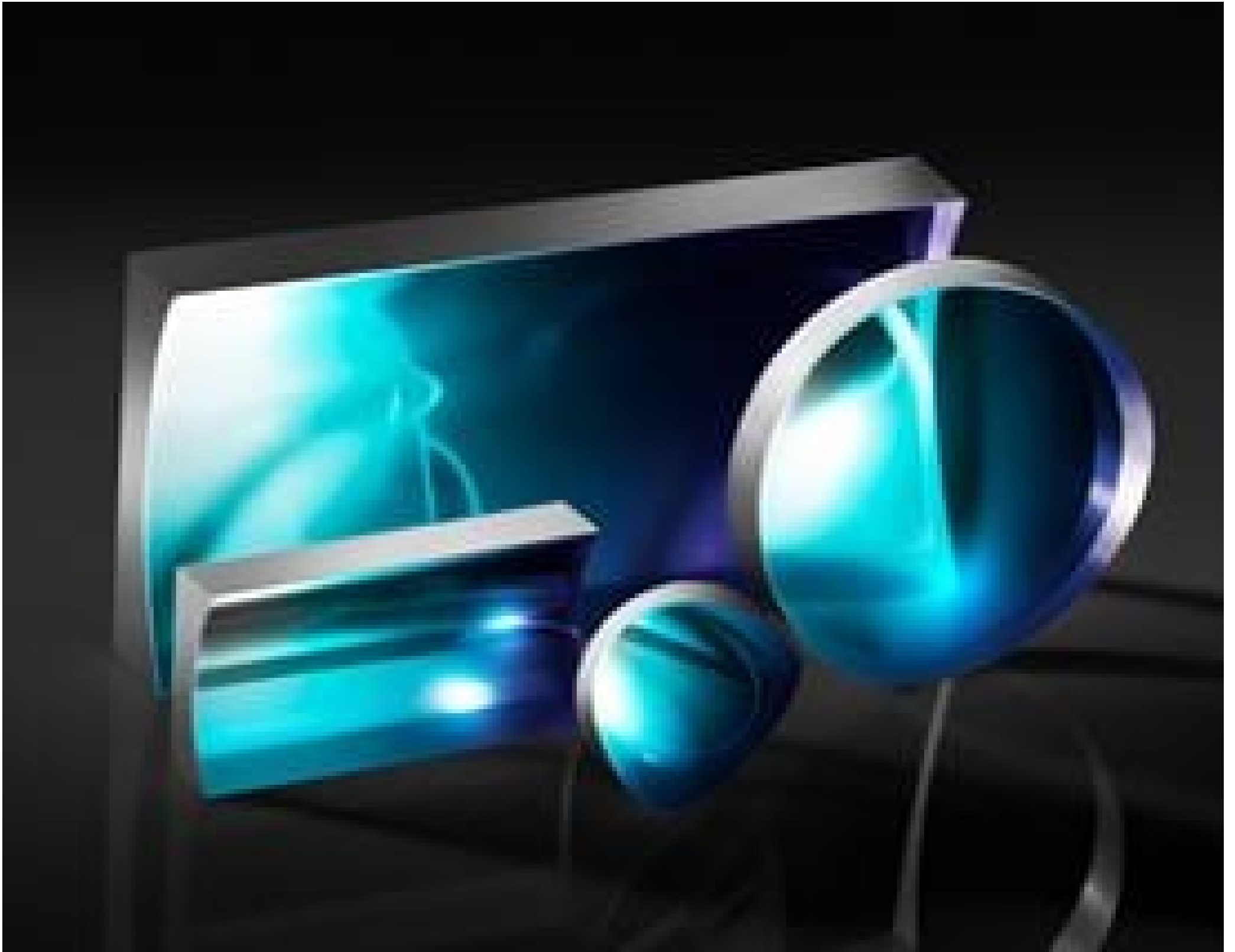
TECHSPEC® Illumination Grade PCV Cylinder Lenses