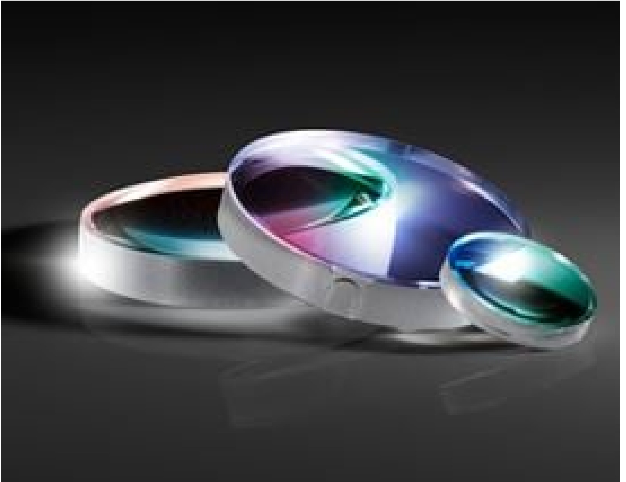
Molded Acrylic Aspheric Lenses