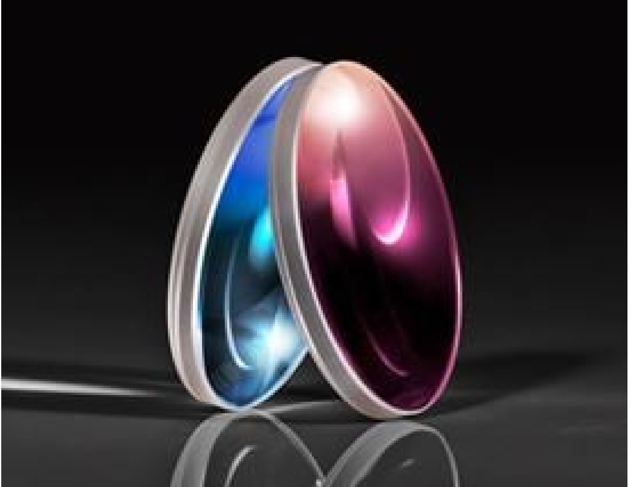
Calcium Fluoride Double-Convex (DCX) Lenses