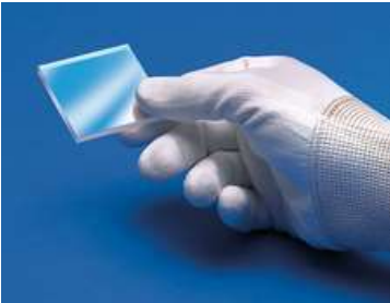
Component Handling Tools

These optics require special handling to avoid damage and ensure long-term performance. Proper handling, cleaning, and storage are essential to maintain optical quality. Explore our Optics Cleaning Resources for step-by-step guides and best practices. For personalized assistance, Email us or Chat with our technical support team.