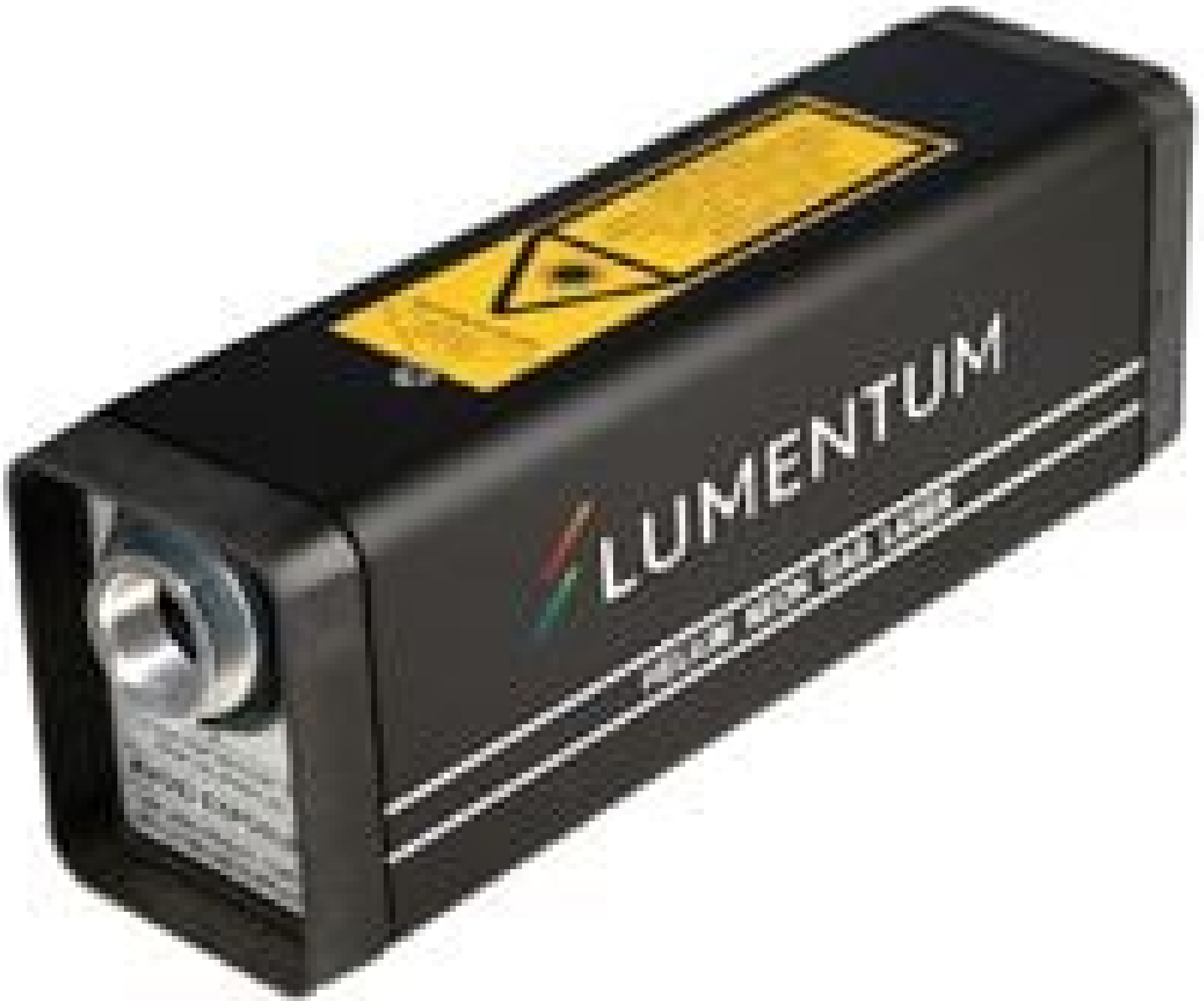
Low-Noise Lumentum Helium-Neon Laser with self-contained power supply