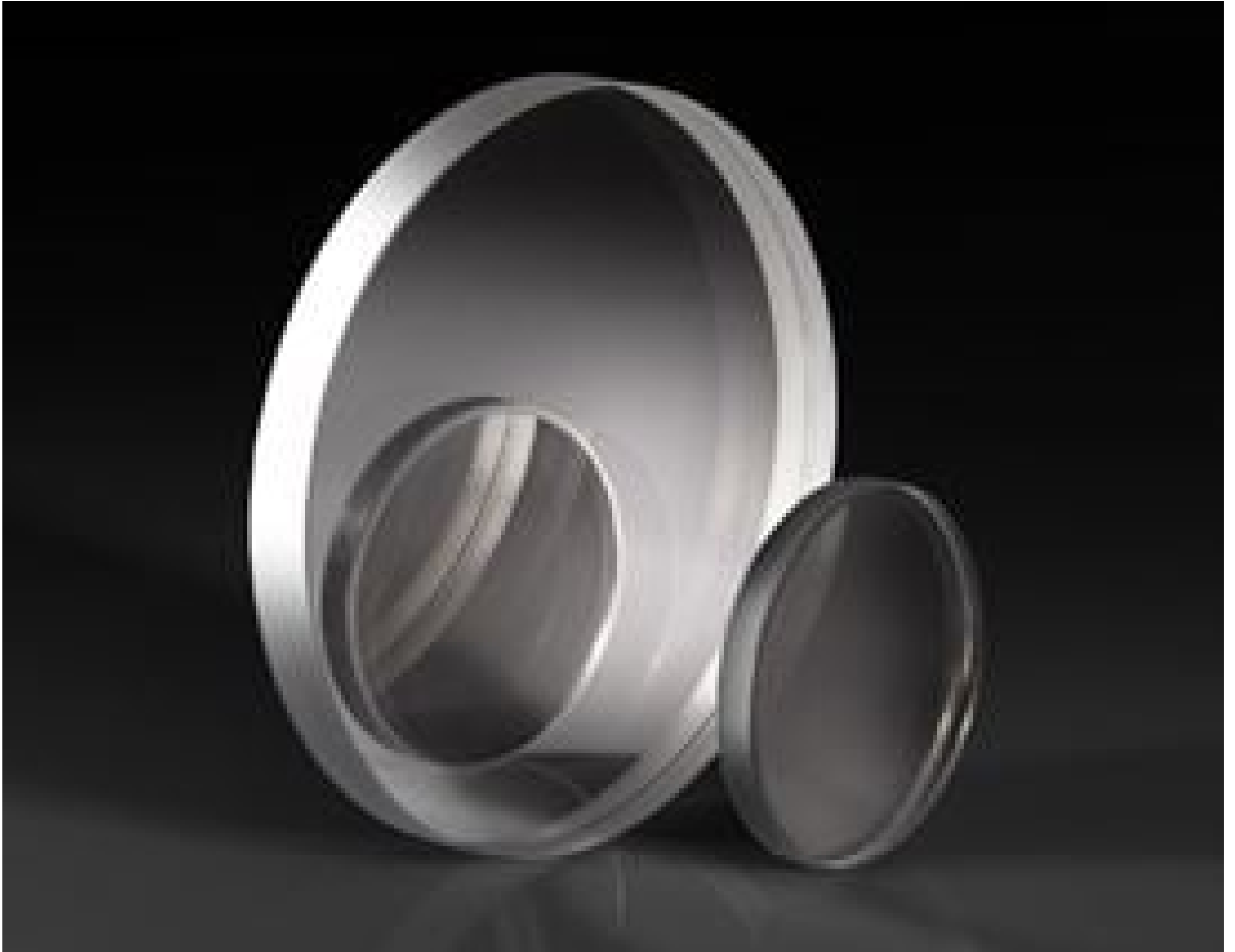
UV-NIR Neutral Density Filters