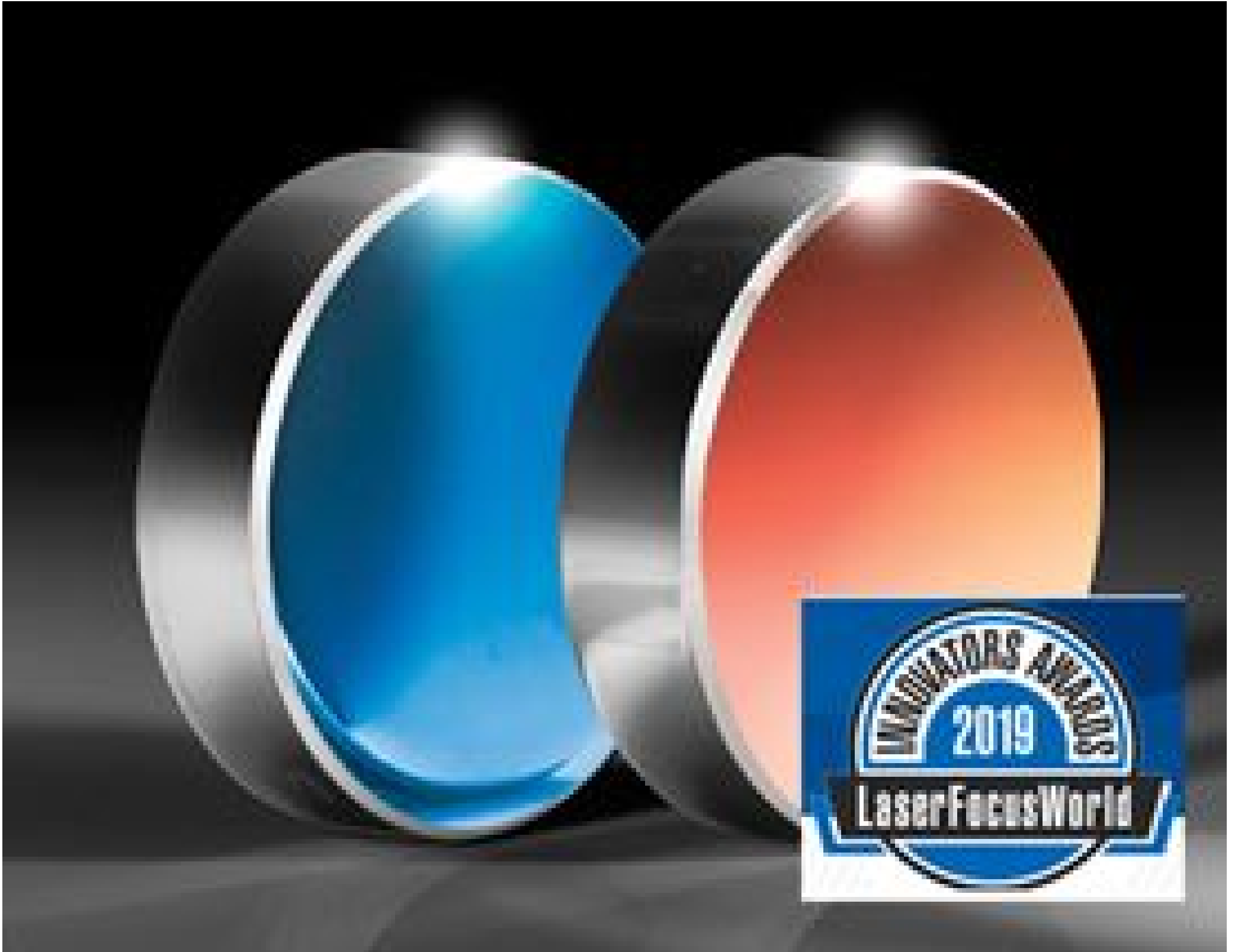
Extreme Ultraviolet (EUV) Flat Mirrors