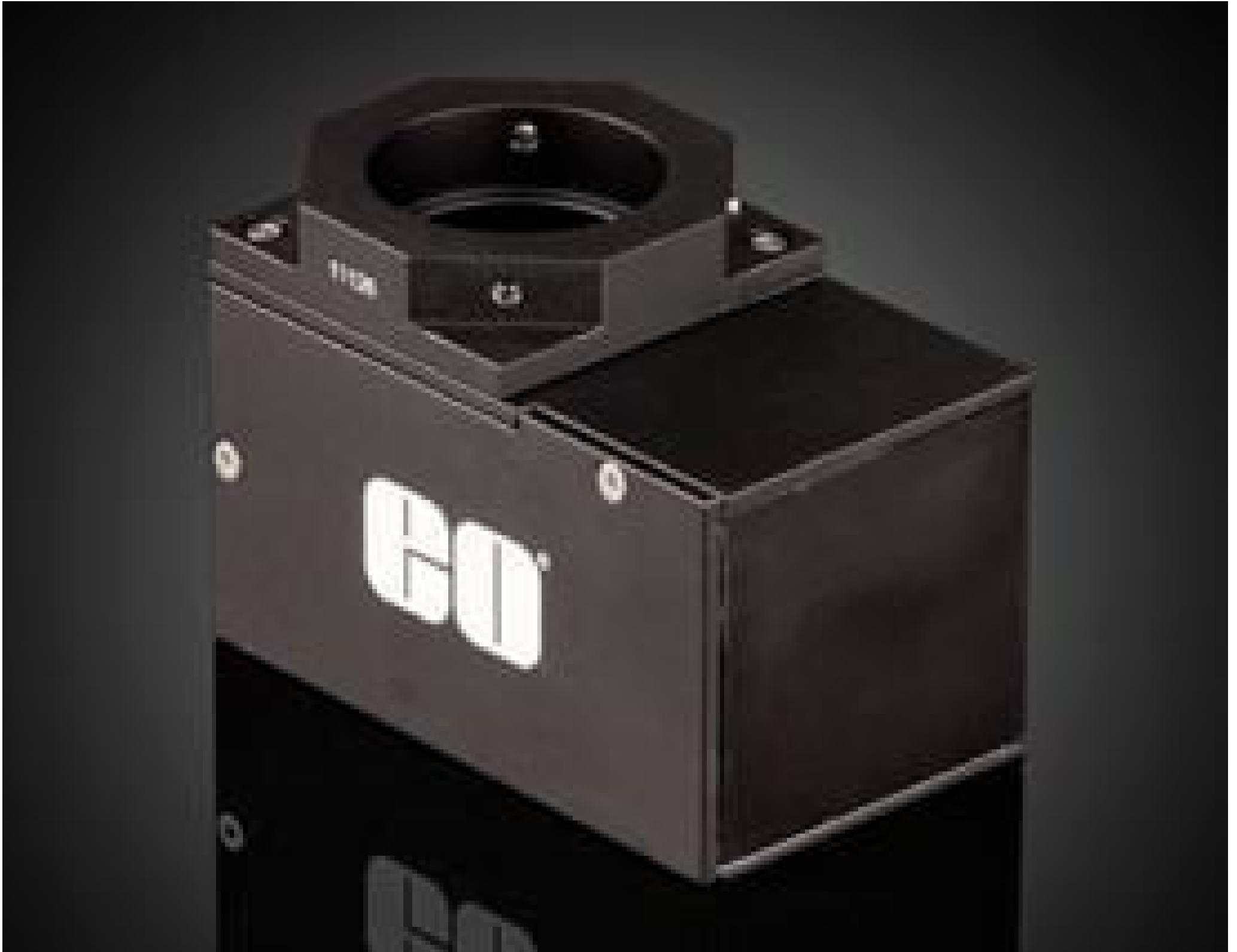
Optical Axis Offset Prism Adapter