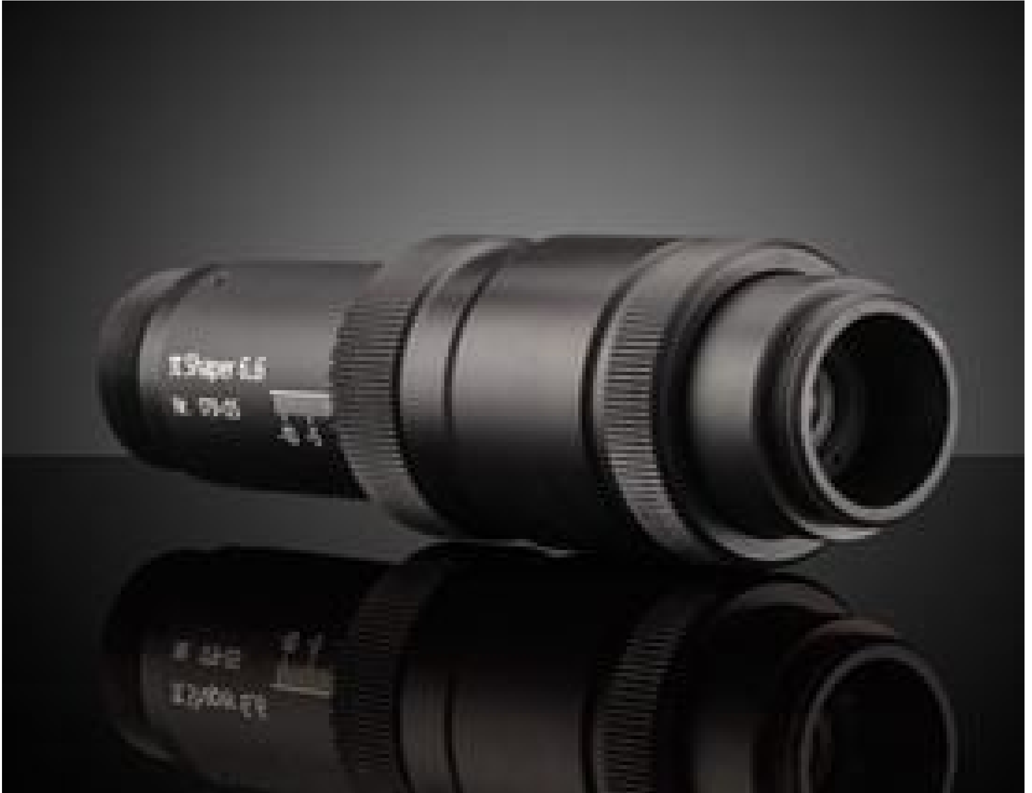
Flat Top Beam Shaper