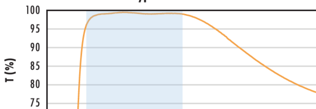
N-BK7 with VIS-EXT Coating Typical Transmission

Typical transmission of a 3mm thick N-BK7 window with VIS-EXT (350-700nm) coating at 0° AOI.