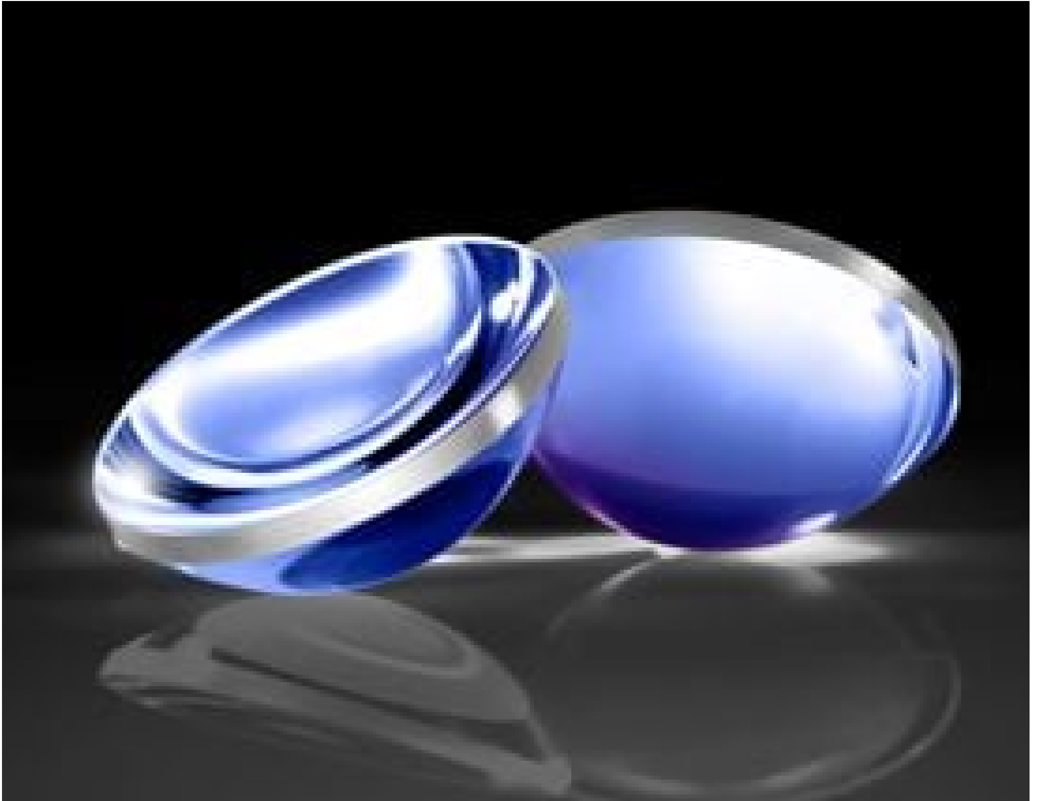
TECHSPEC® Laser Line Coated Aspheric Lenses