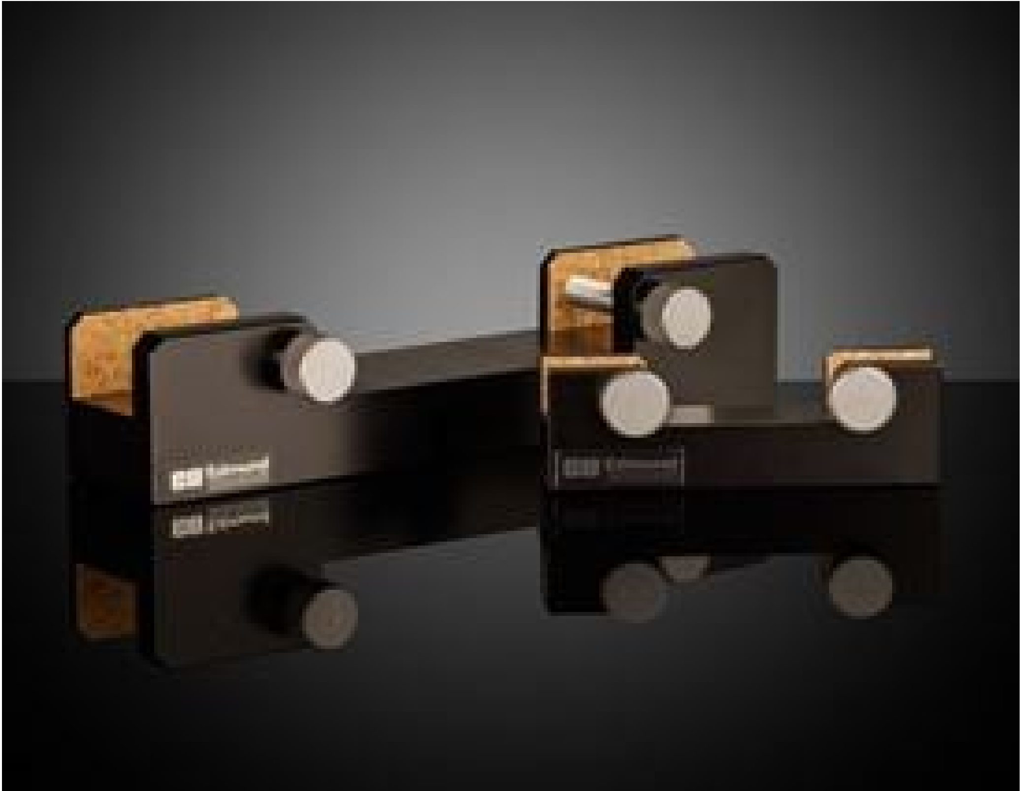
Fixed Filter Mounts