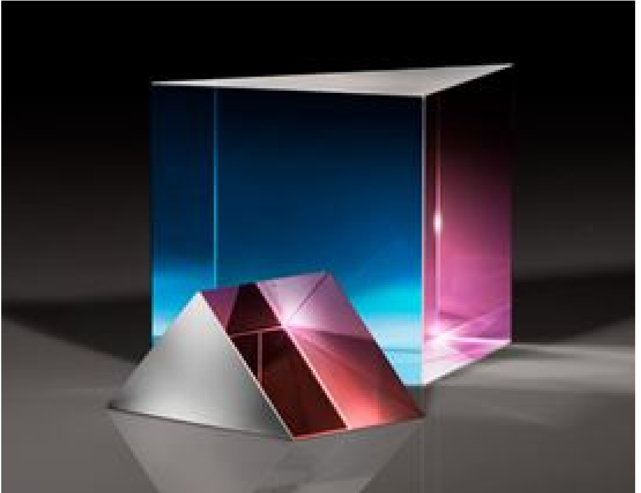
TECHSPEC High Tolerance UV Fused Silica Right Angle Prisms