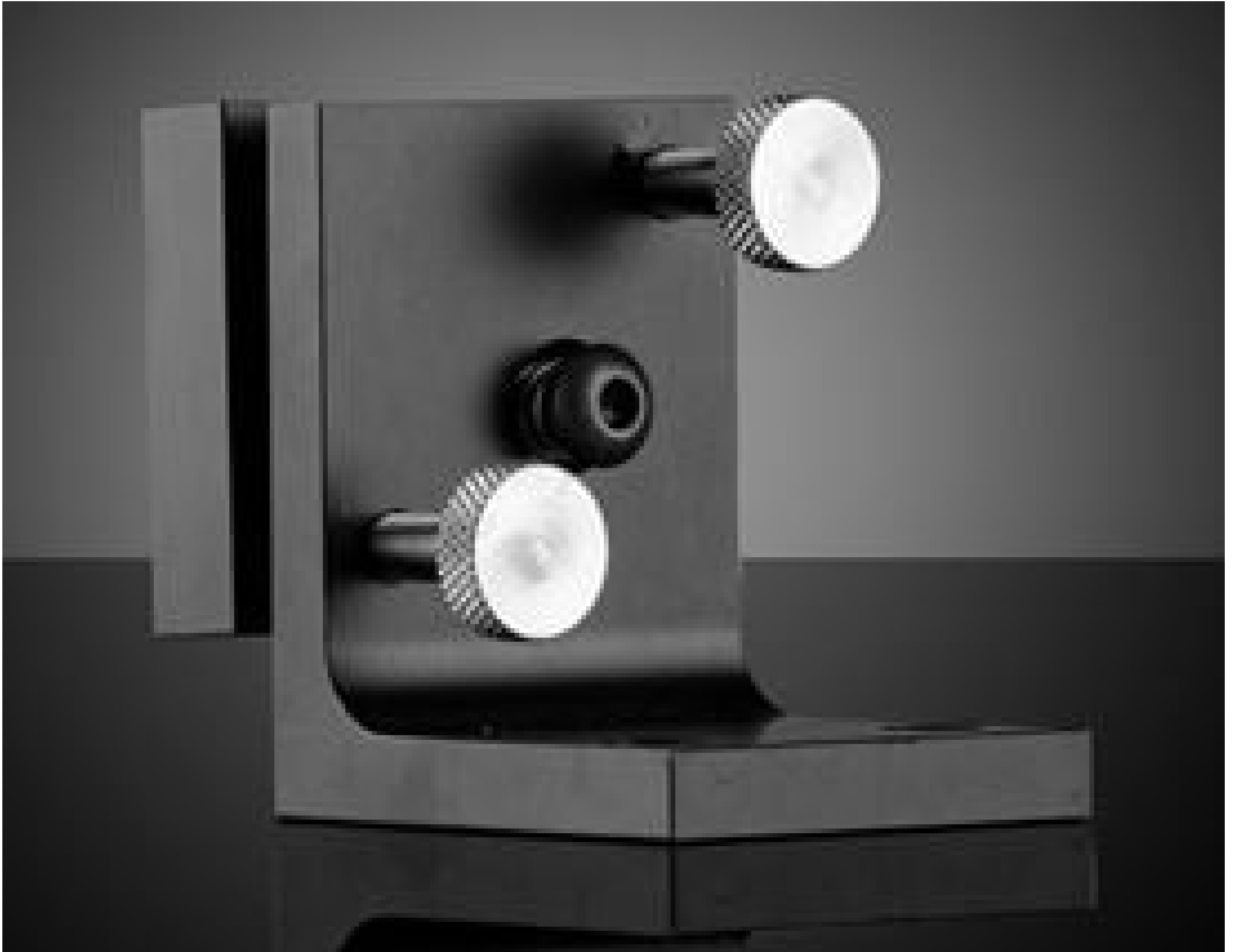
1.5" Reverse Angle Mirror Mount