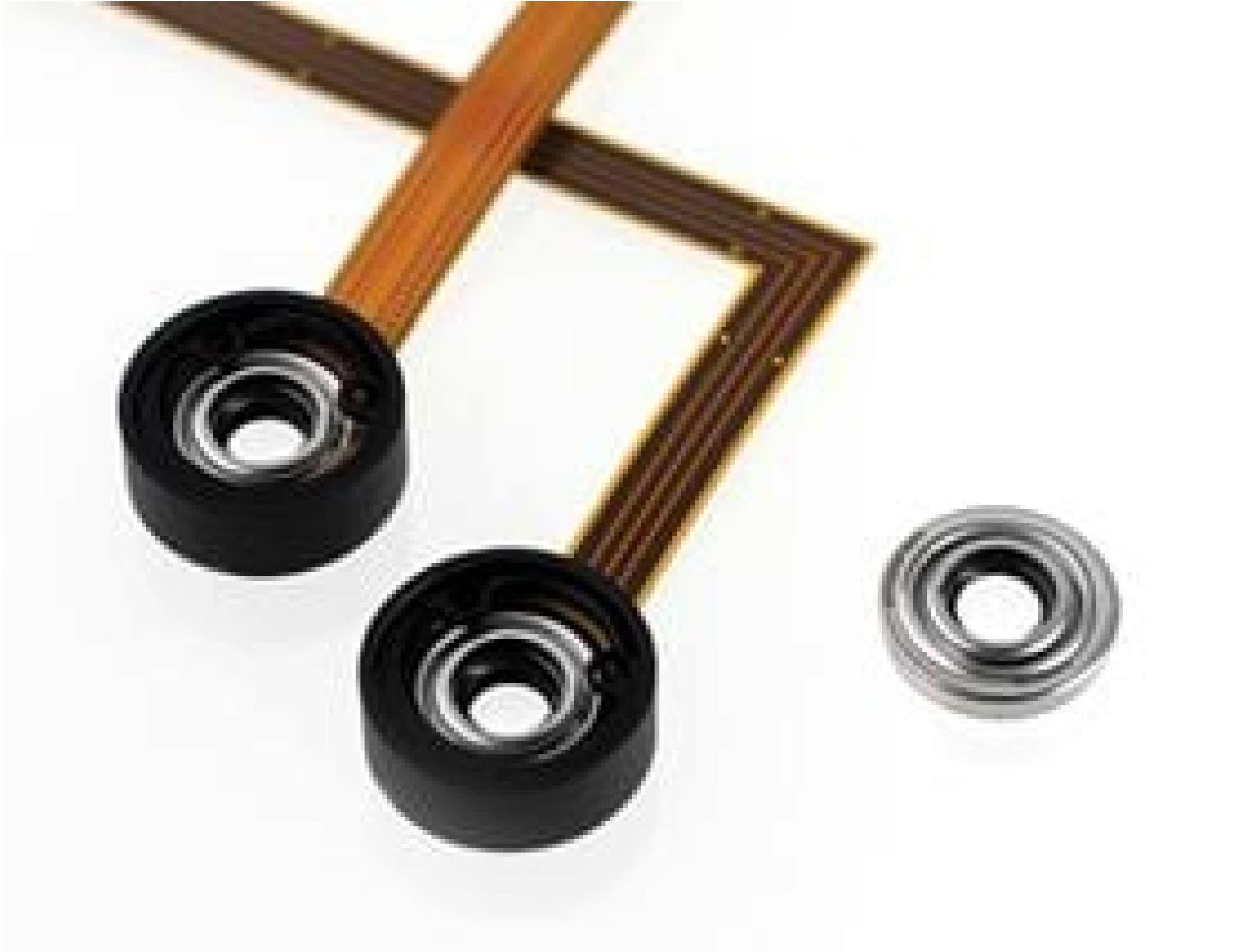
Corning® Varioptic® Variable Focus Liquid Lenses