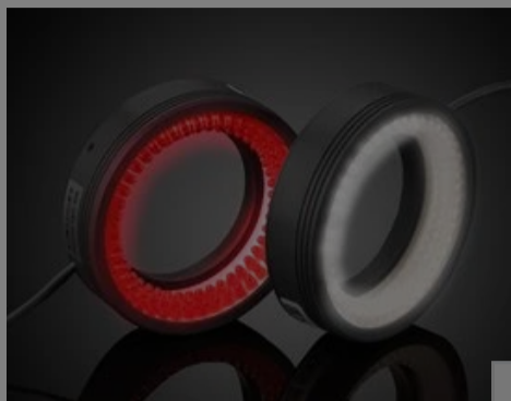
CCS Low-Angle LED Ring Lights