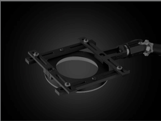
Ring Light Configuration