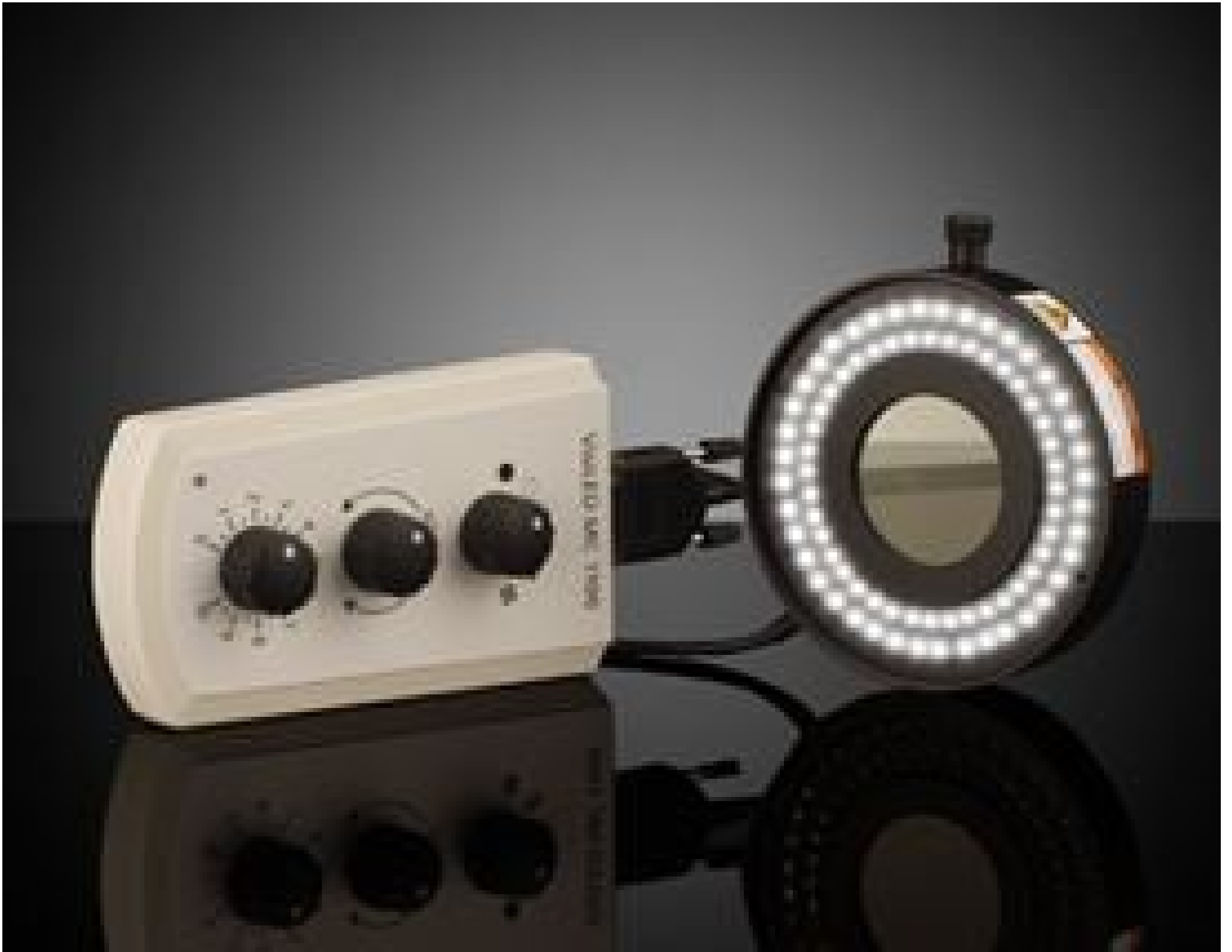
Ring light, controller & power supply required and sold separately.