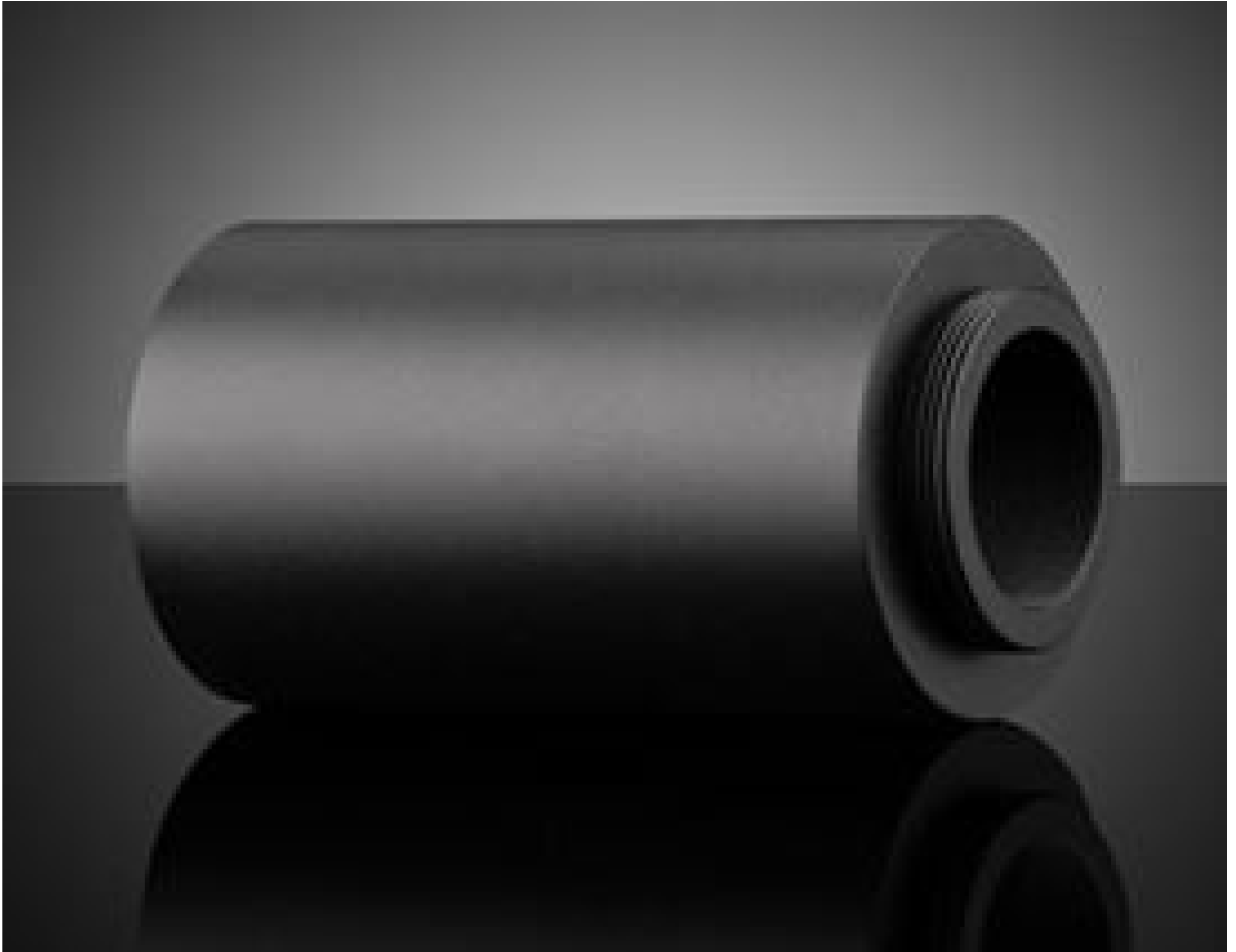
#23-901, 5X, 95mm, C-Mount Parfocal Adapter