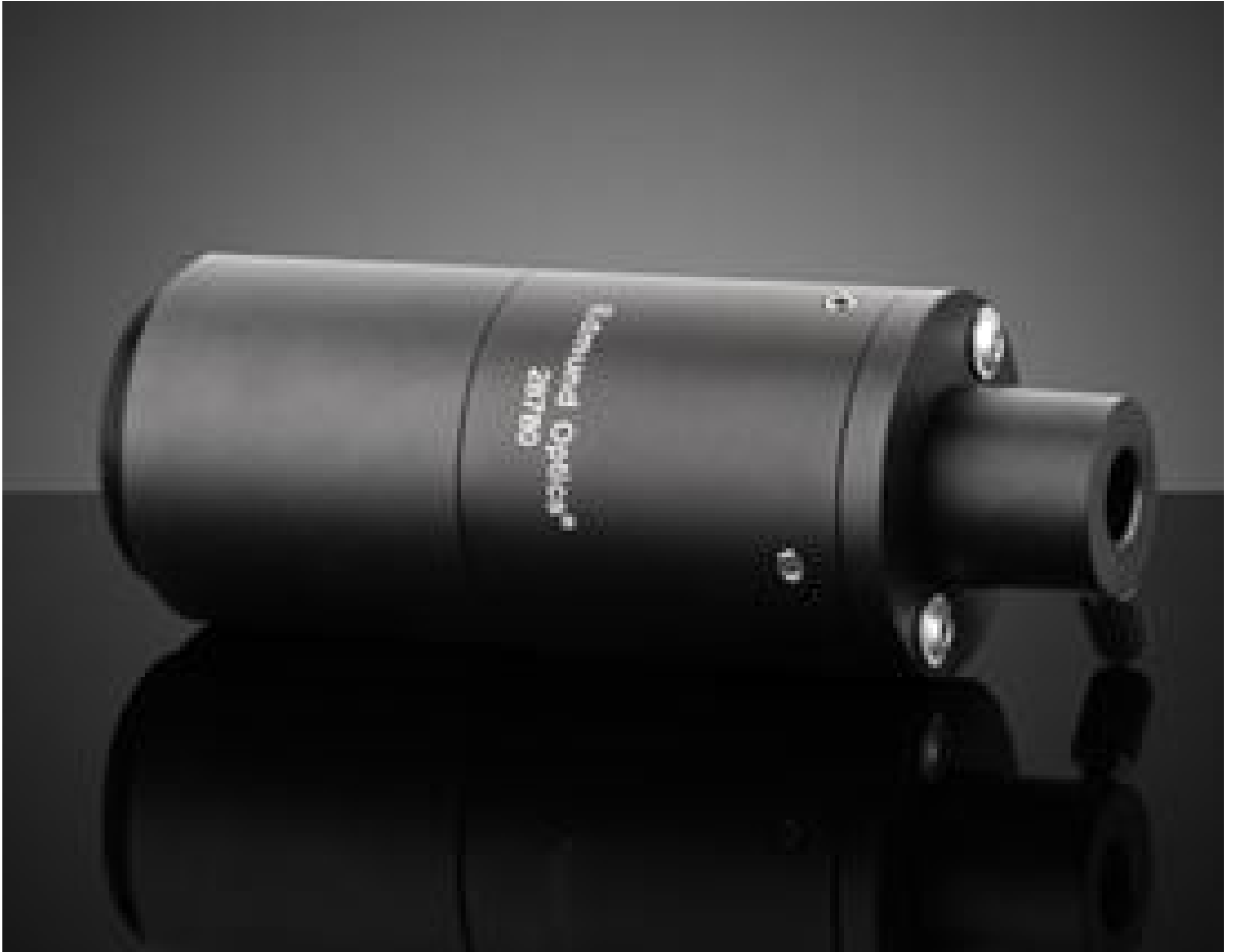
20X Focusing Lens