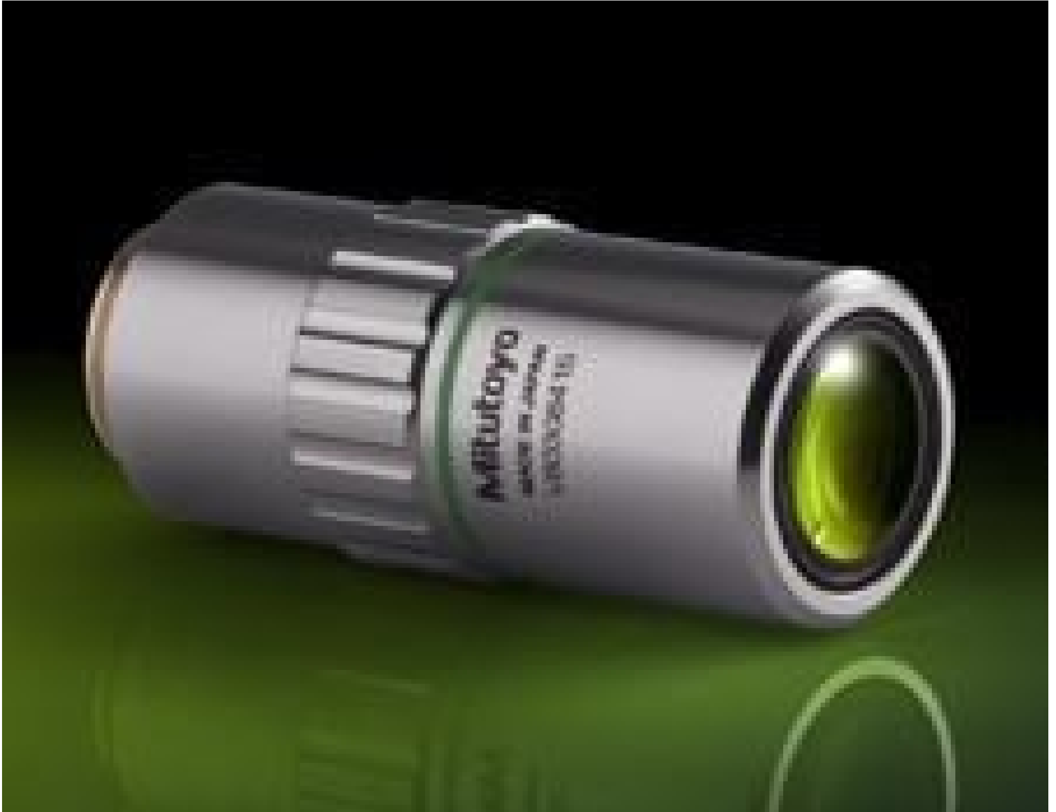
20X Mitutoyo Plan Apo Infinity Corrected Long WD Objective, #46-145