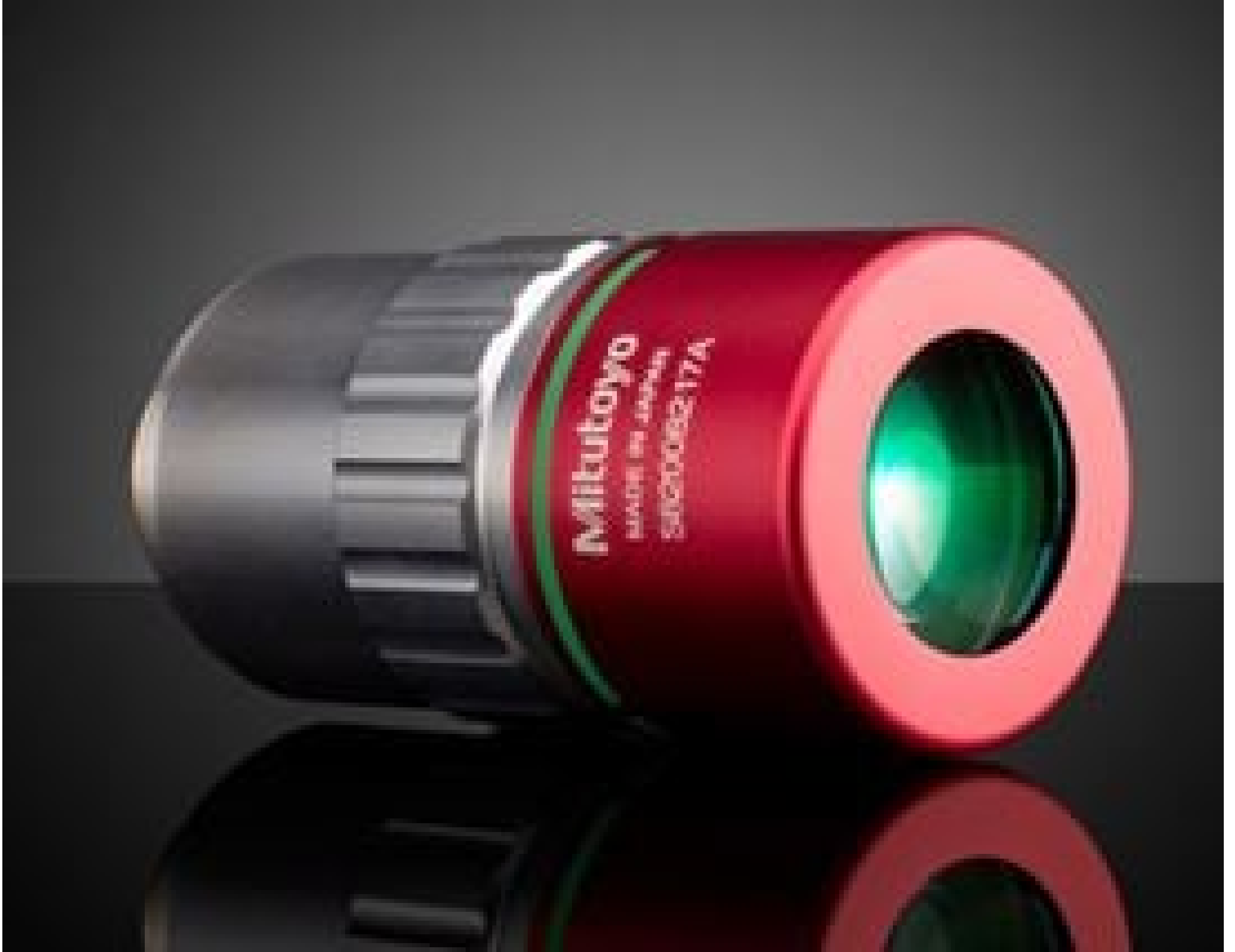
20X Mitutoyo Plan Apo NIR B Infinity Corrected Objective, #89-350