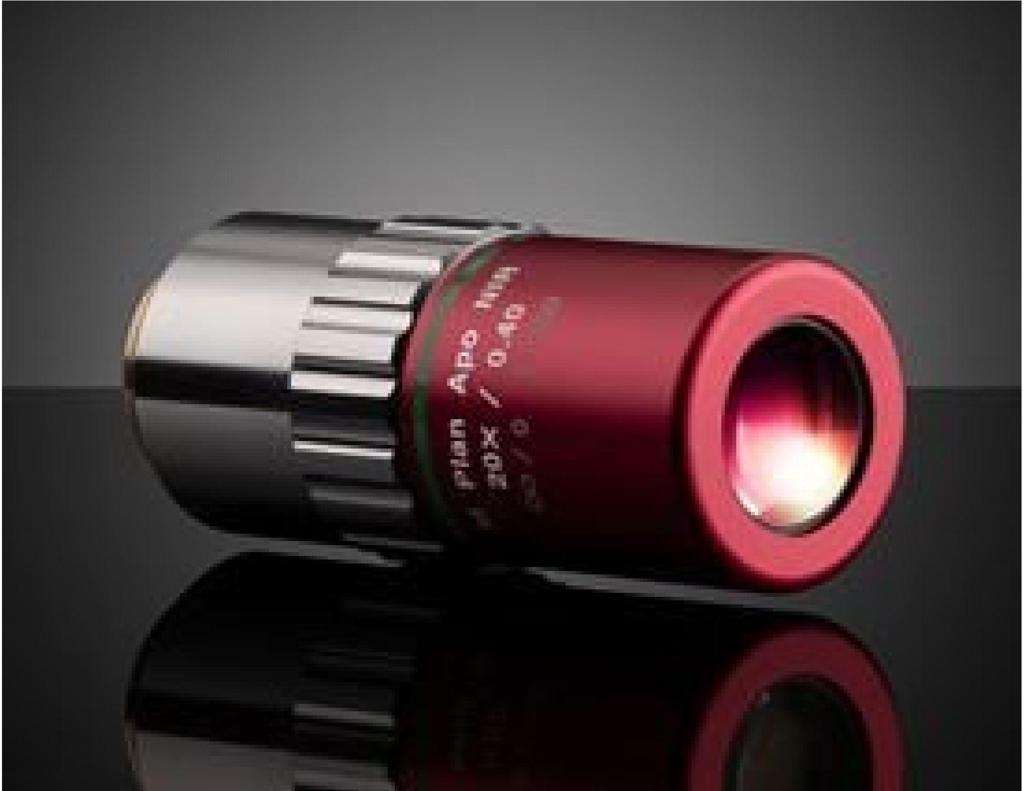
20X Mitutoyo Plan Apo NIR Infinity Corrected Objective, #46-404