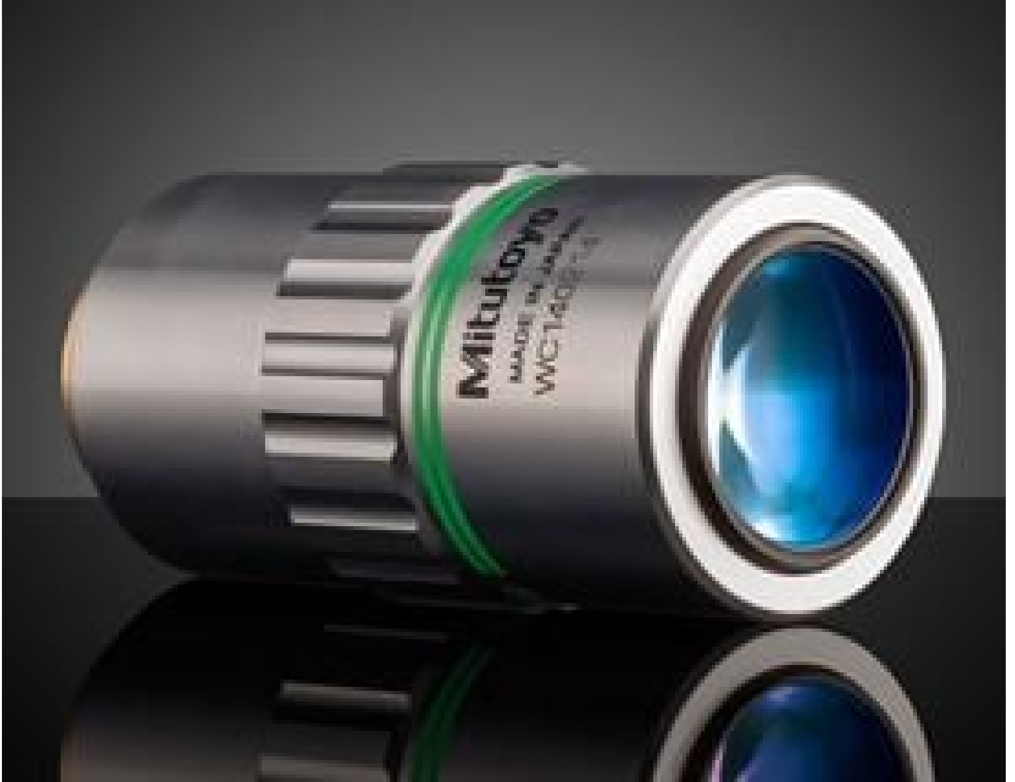
20X Mitutoyo Plan Apo SL Infinity Corrected Objective, #46-398