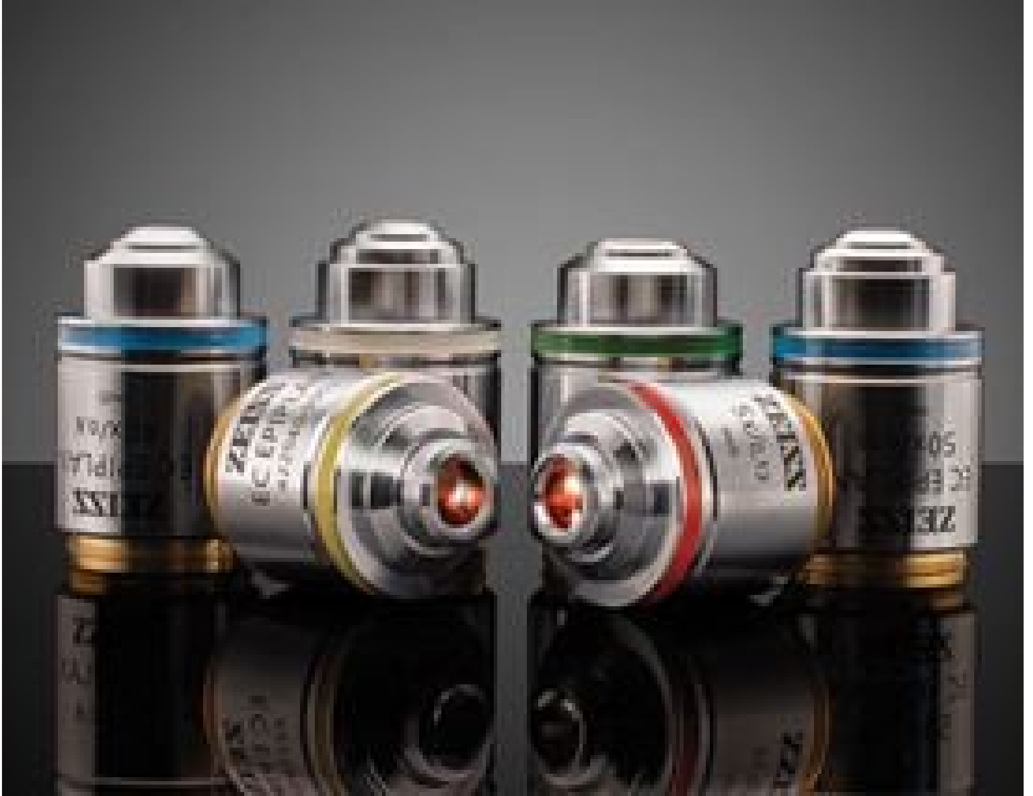
ZEISS EC Epiplan Objectives