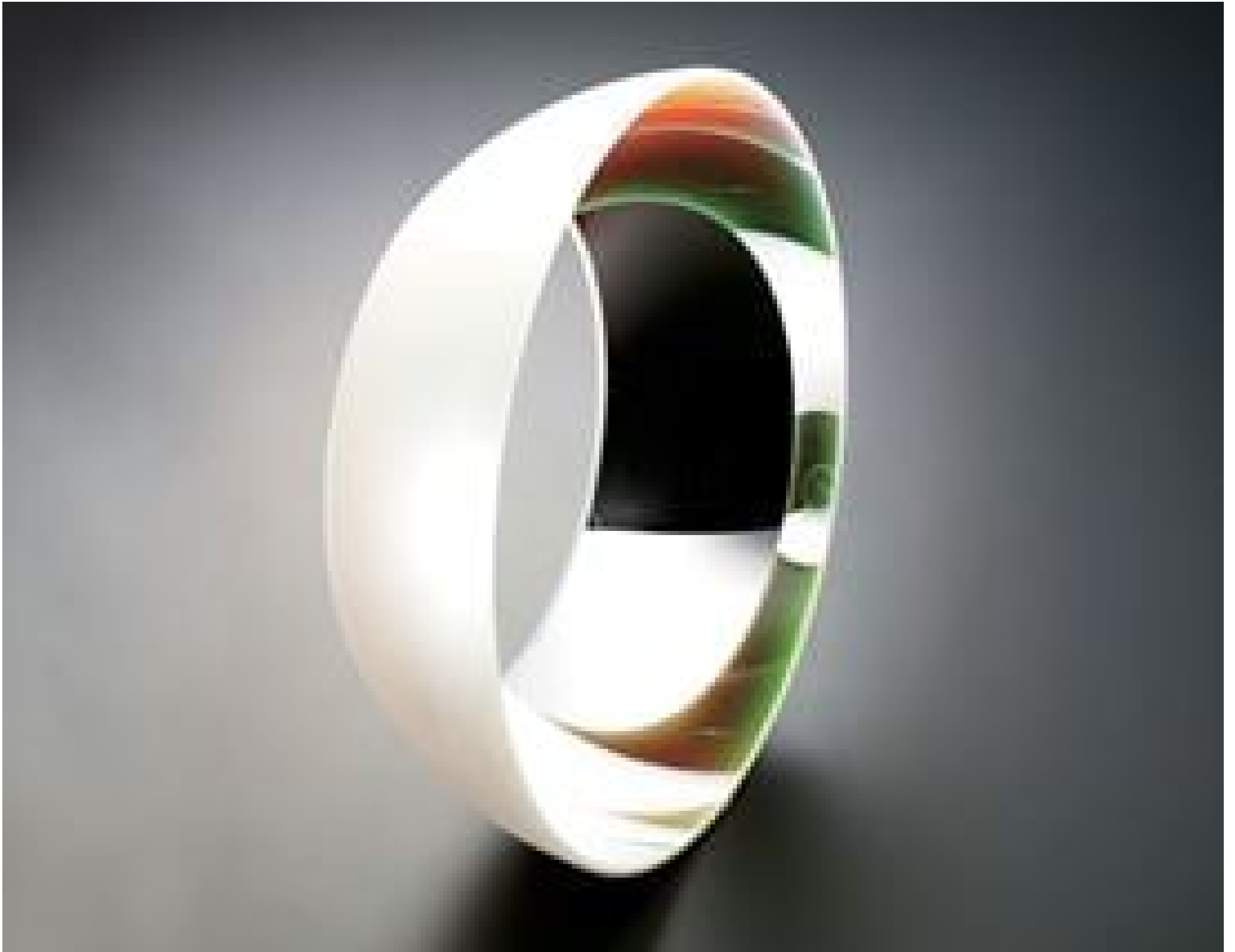
Precision Ellipsoidal Reflectors