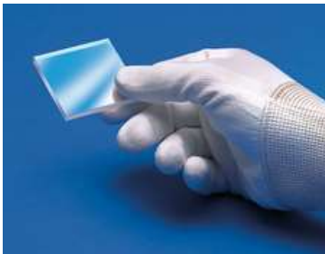
Component Handling Tools

These optics require special handling to avoid damage and ensure long-term performance. Proper handling, cleaning, and storage are essential to maintain optical quality. Explore our Optics Cleaning Resources for step-by-step guides and best practices. For personalized assistance, Email us or Chat with our technical support team.