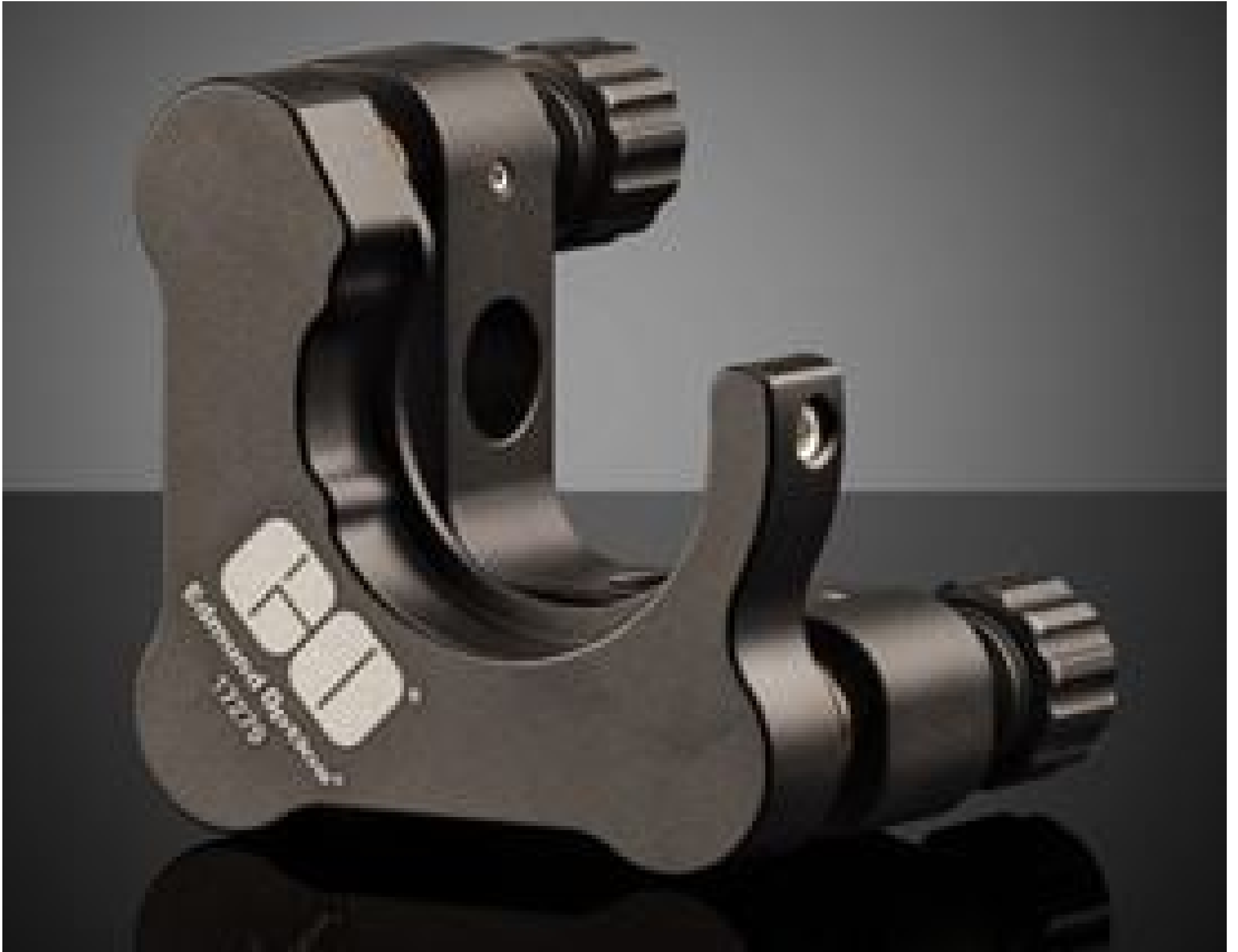
#17-279, 25.0/25.4mm Optic Dia., E-Series Clear Edge Kinematic Mount