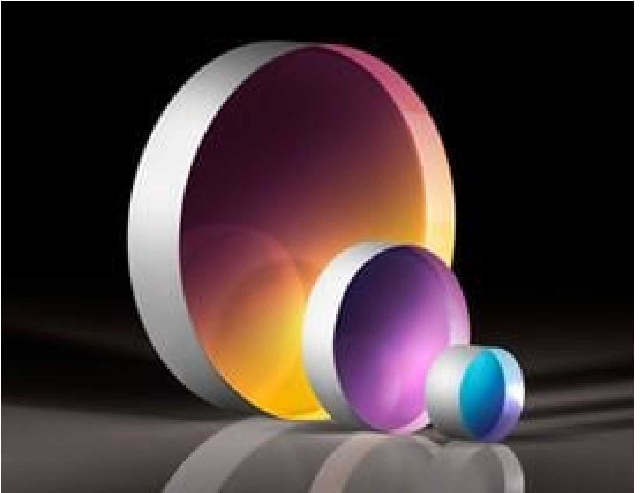
TECHSPEC Excimer Laser Line Mirrors