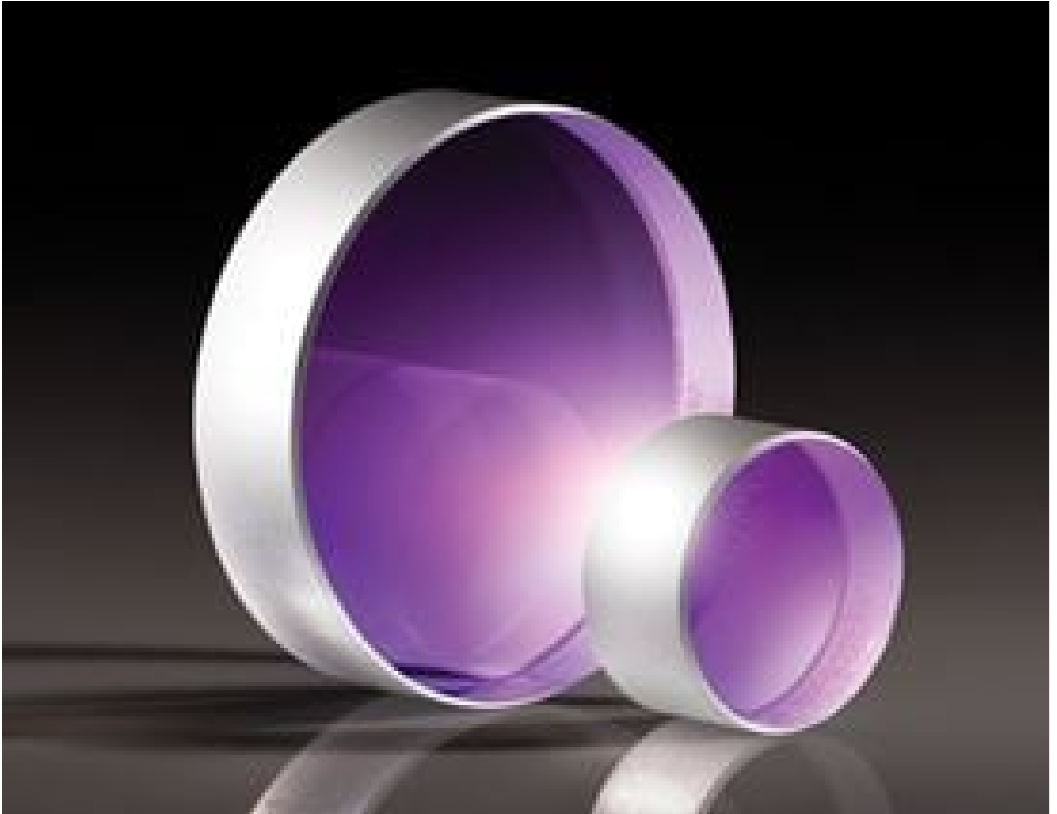
TECHSPEC \lambda/10 Laser Line Coated Windows