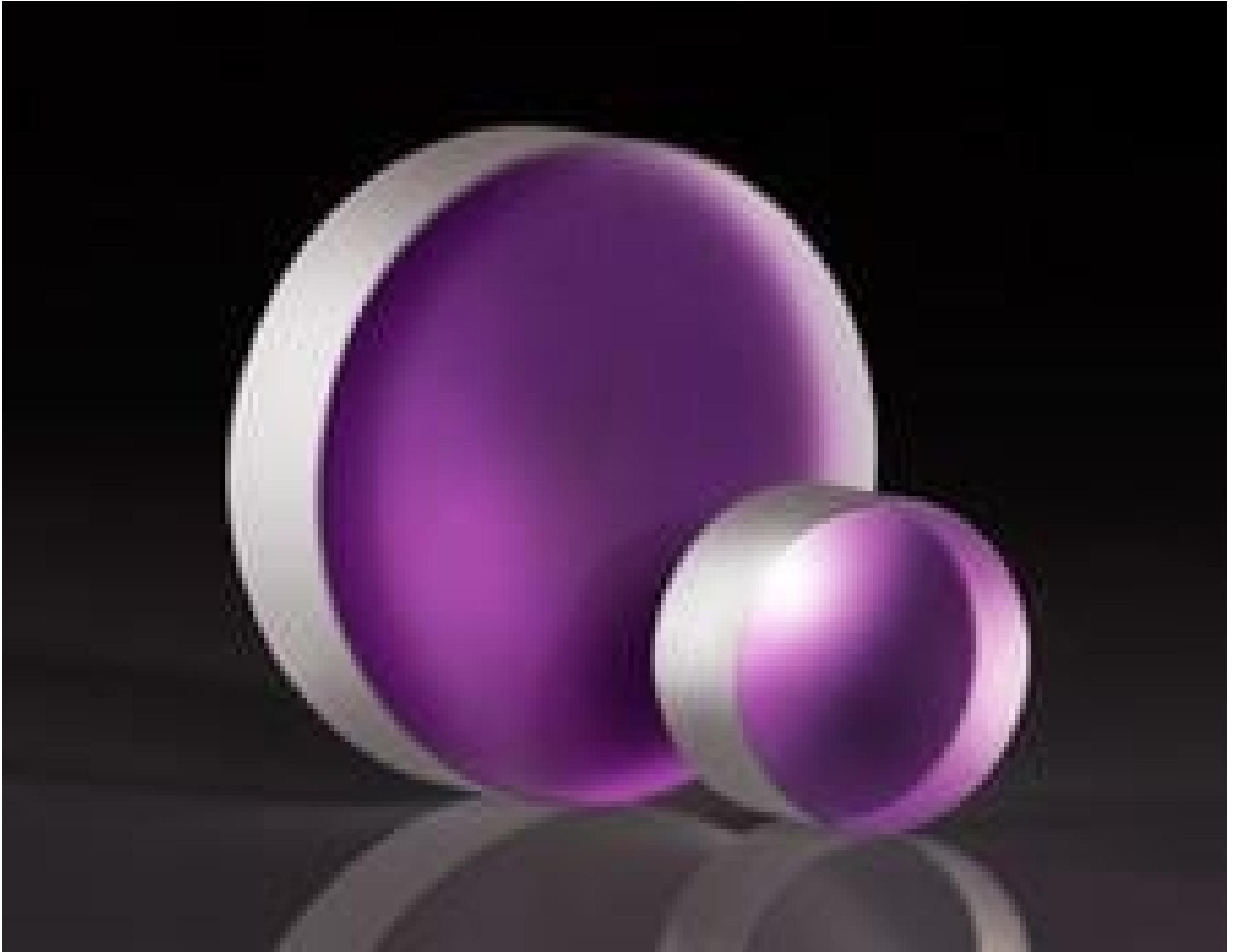
TECHSPEC® Fiber Laser Mirrors