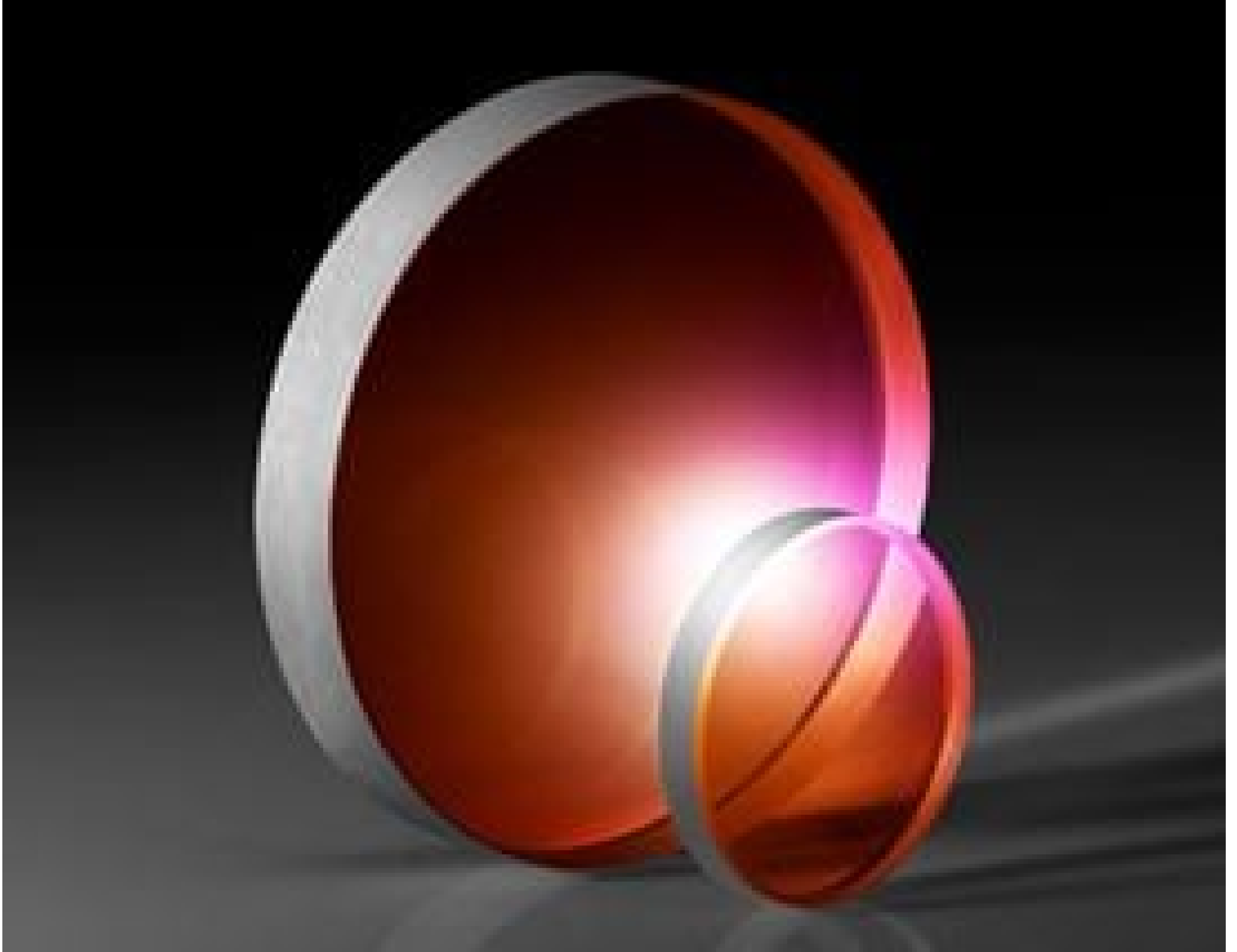
Calcium Fluoride (CaF 2 ) Wedged Windows