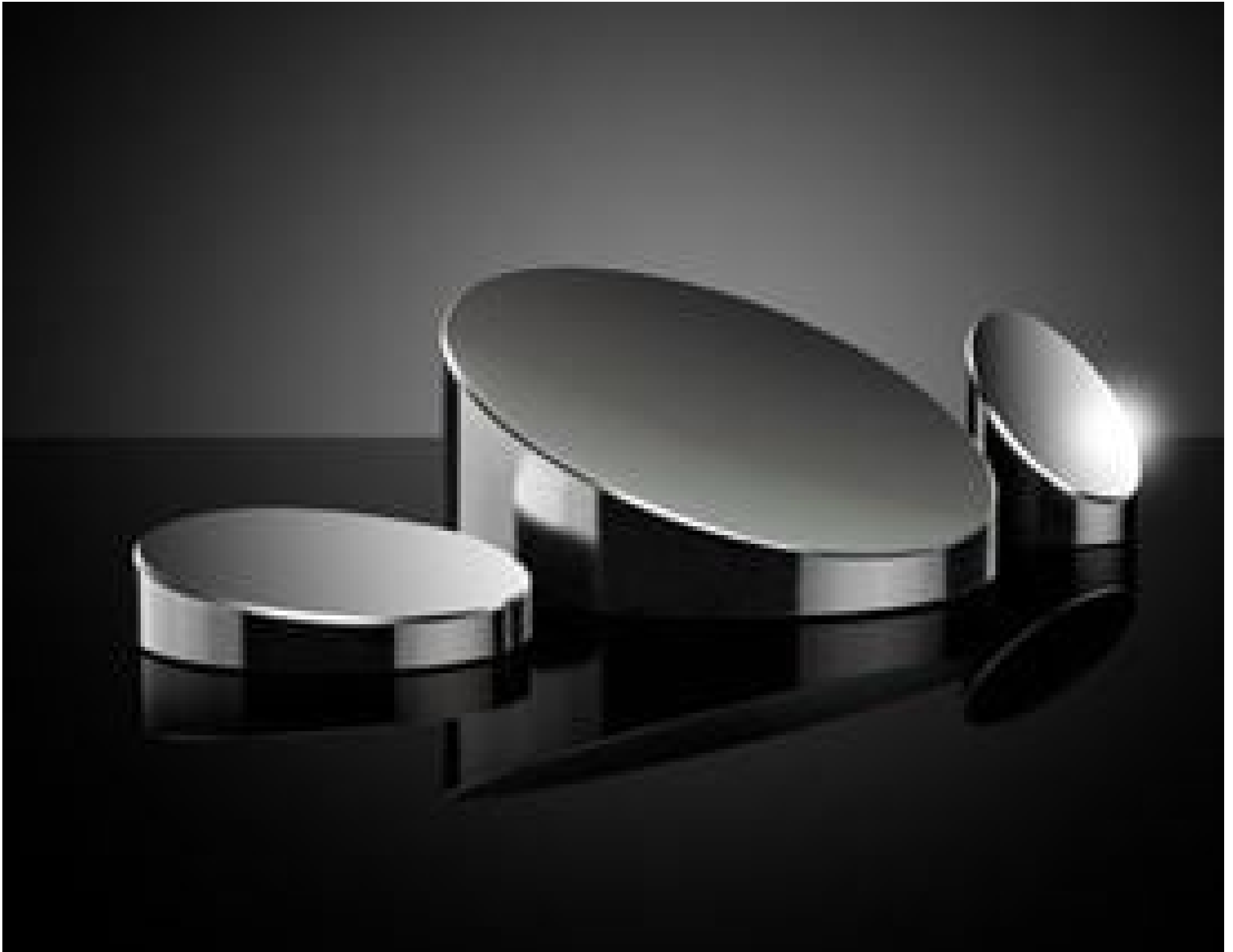
TECHSPEC Aluminum Off-Axis Parabolic Mirrors