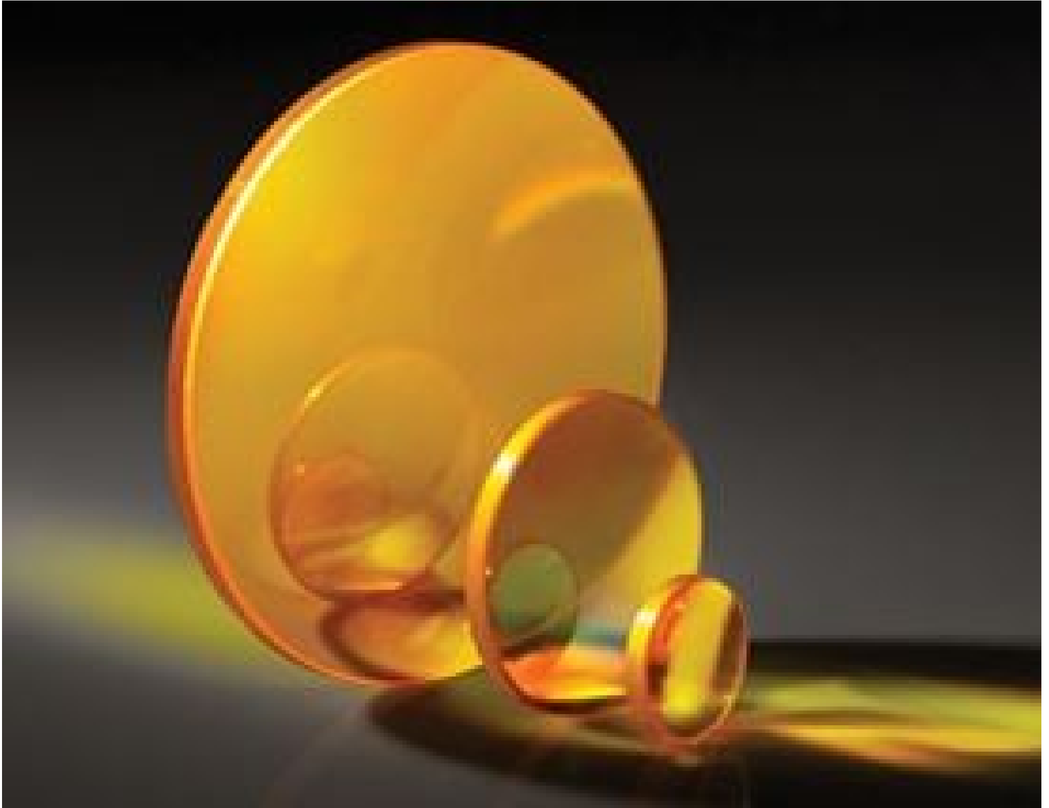
TECHSPEC Zinc Selenide (ZnSe) Plano-Convex (PCX) Lenses