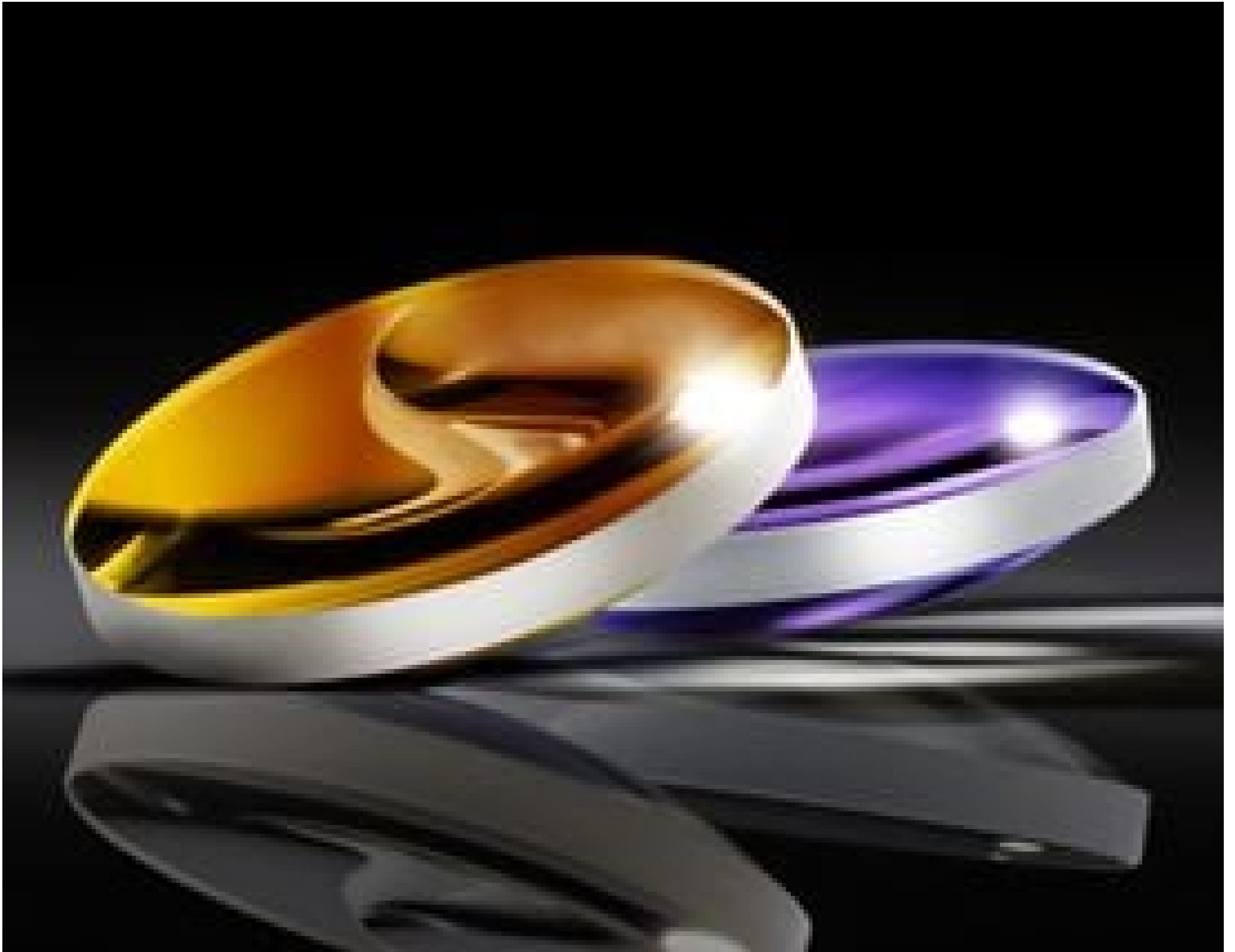
High Precision Laser Grade Aspheric Lenses